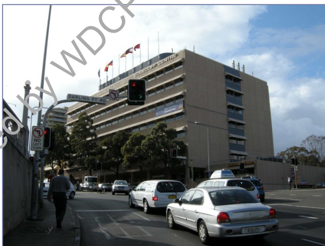
The Edgecliff Centre building