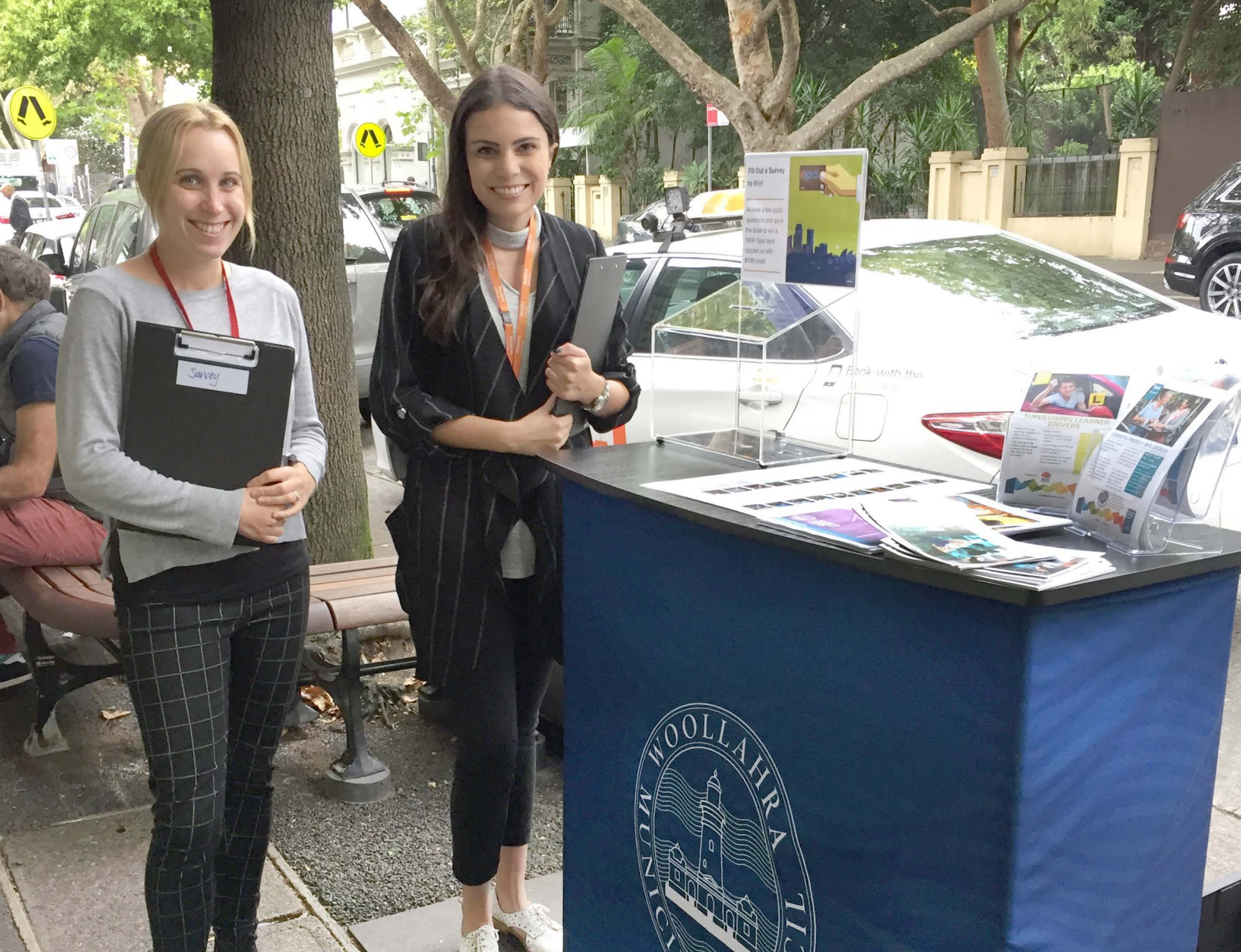
Community Services pop up stall