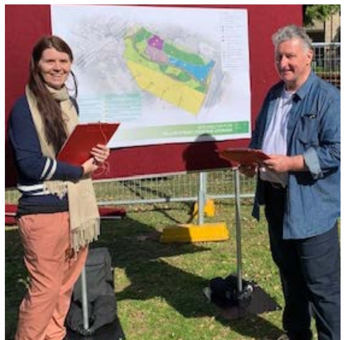
Dillon Street Reserve community engagement