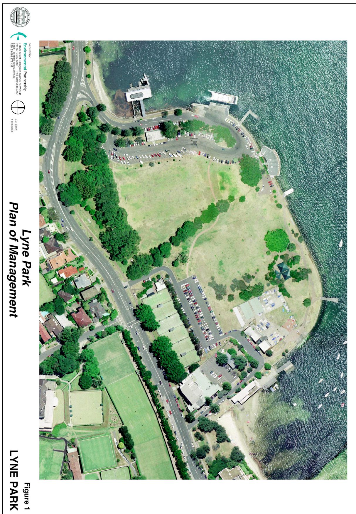
Figure 1: Lyne Park, Rose Bay.