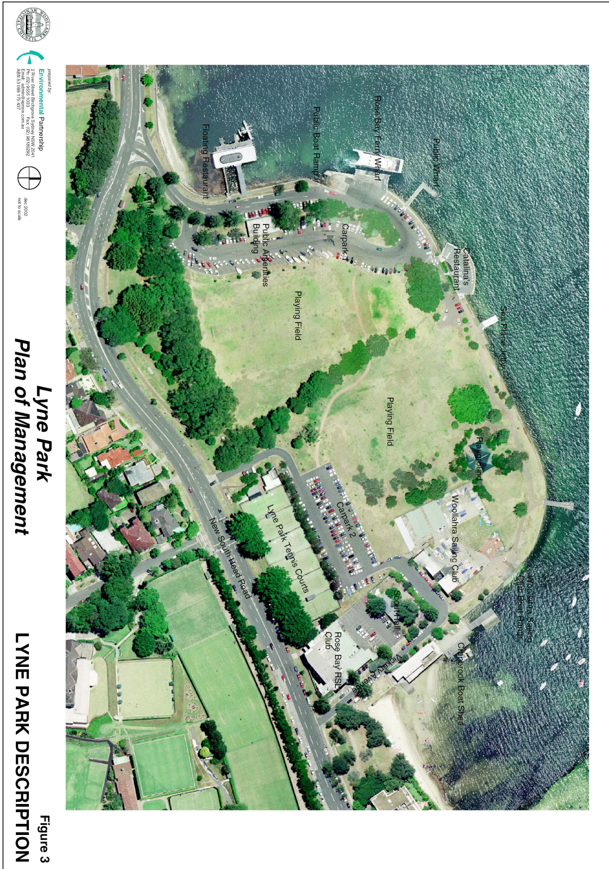
Figure 3: Lyne Park Description