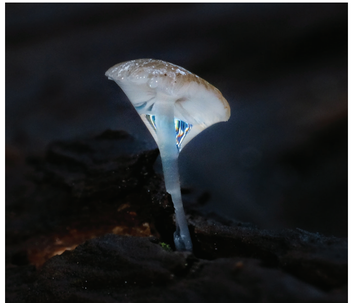
Mushrooms in Cooper Park

The following table provides a snapshot of the status of the progress of all Actions as at 30 June 2022.