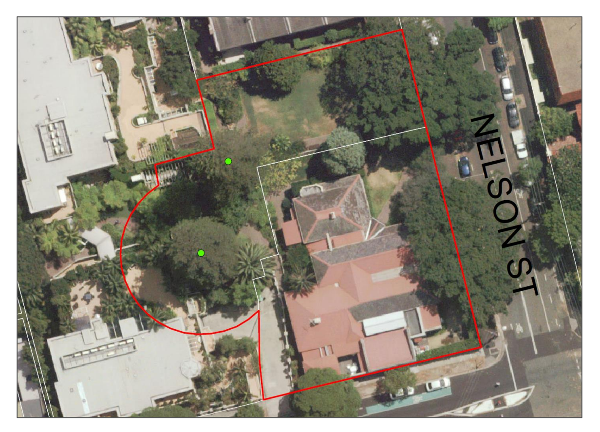
FIGURE 2 Building curtilage The curtilage for the building and its landscape setting for Brougham, at 4A Nelson Street and 118 Wallis Street