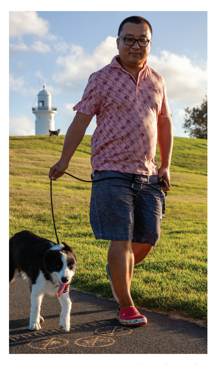
Macquarie Lighthouse, Vaucluse as seen from the Christison Park cliff walk