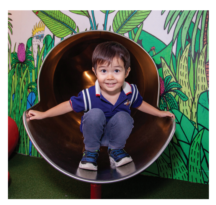
Woollahra Library at Double Bay