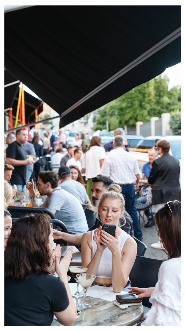
A Night Out event in Paddington

We will track the achievement of our goal and strategies through the measurement and reporting of performance indicators: