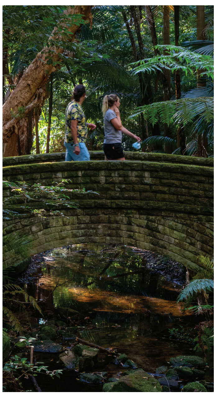
Moon Bridge, Cooper Park

We will track the achievement of our goal and strategies through the measurement and reporting of performance indicators: