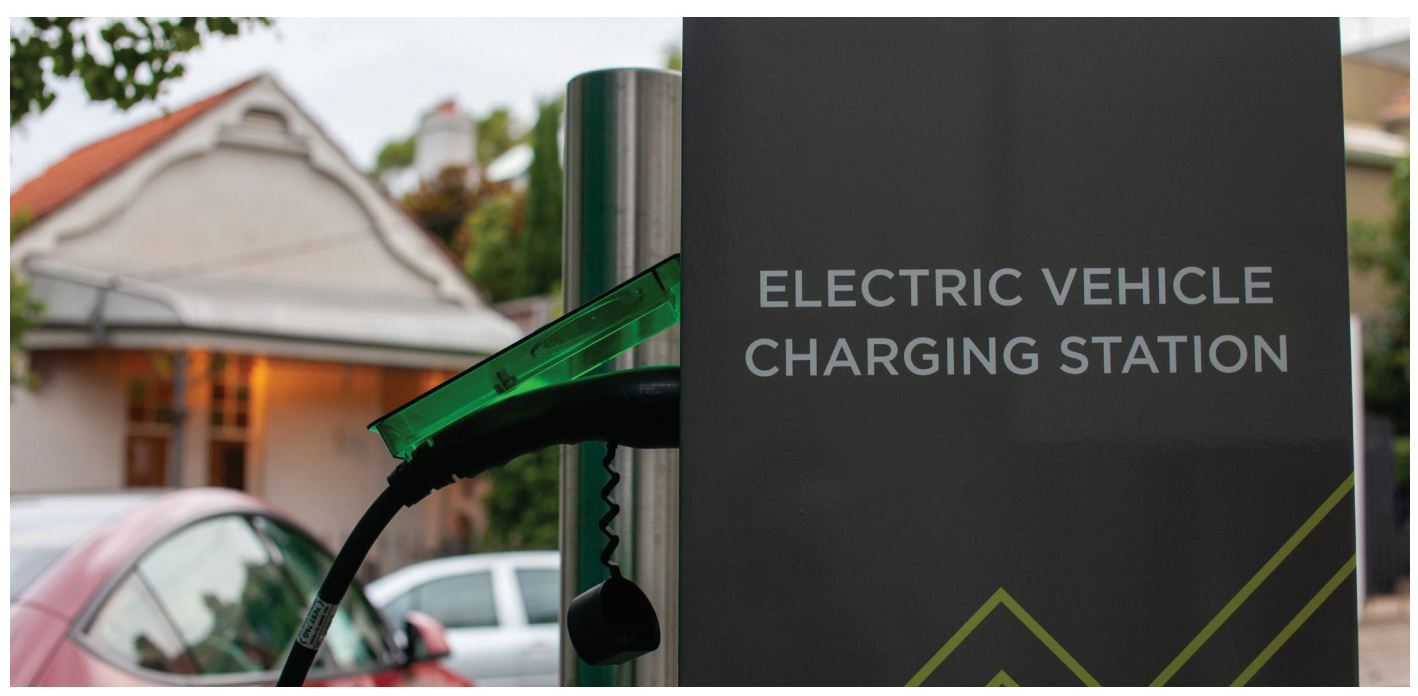
Electric Vehicle charging station in Goodhope Street, Paddington