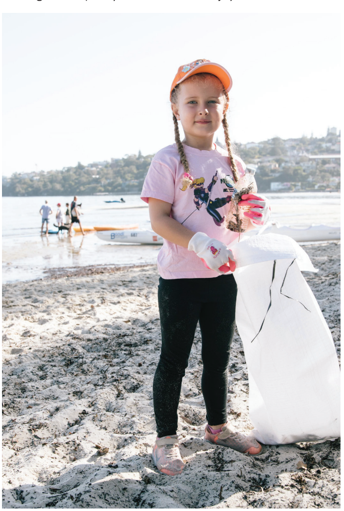
Rose Bay beach clean up

To lead climate action and promote respectful connections between people and place, so we can enhance, protect and celebrate Woollahra's beauty, heritage and quality of life, for the enjoyment of all.