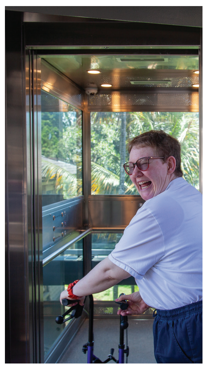
Lift connecting Woollahra Gallery at Redleaf to Blackburn gardens

We will track the achievement of our goal and strategies through the measurement and reporting of performance indicators: