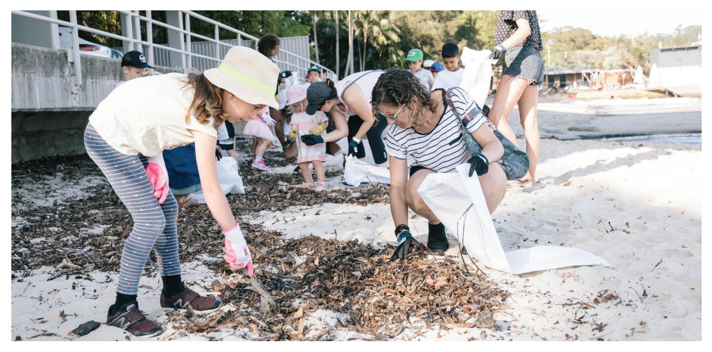
Rose Bay beach clean up