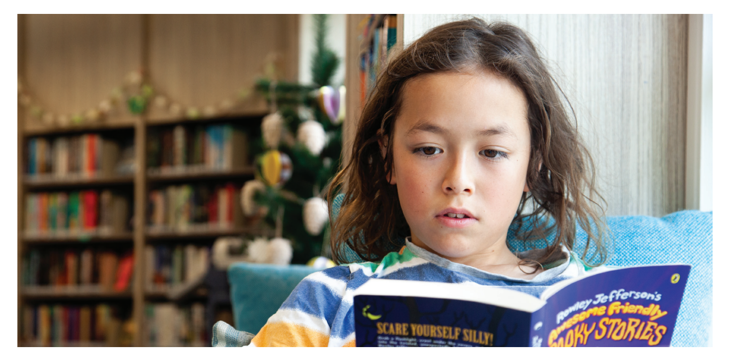
Watsons Bay Library