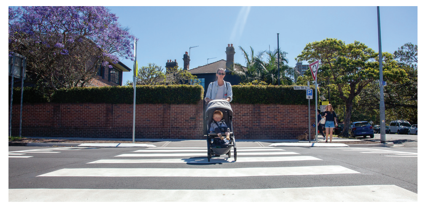
Pedestrian crossing in Double Bay