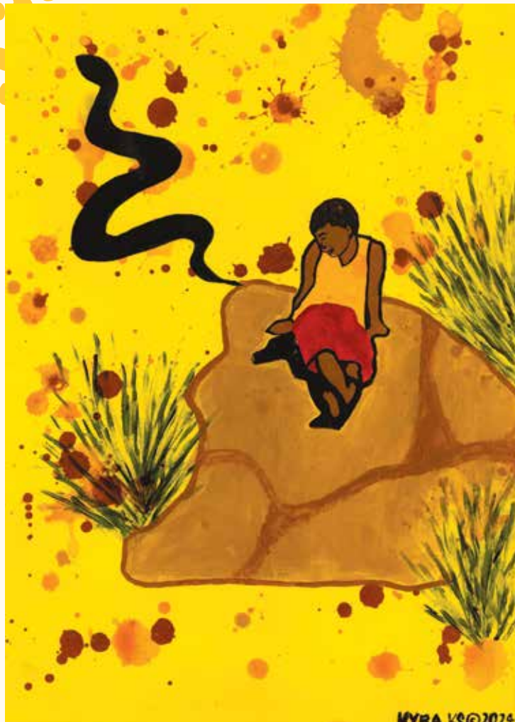
Kyra Kum-Sing My sovereign Malera Bandjalan and Mitakoodi body (2014). Acrylic on archival cotton paper. 51 x 40 cm.

Find out more and book your spot: woollahra.nsw.gov.au/NAIDOC