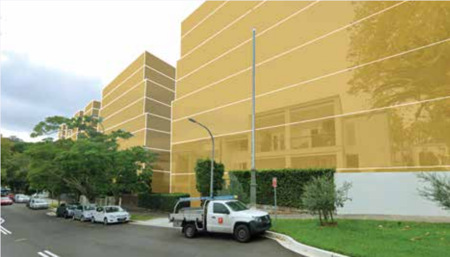
CONCEPT IMAGES: How Court Road, Double Bay could look under the reforms (top) and the bulk and scale of mid-rise development that could be constructed around the Rose Bay Centre and foreshore (bottom)