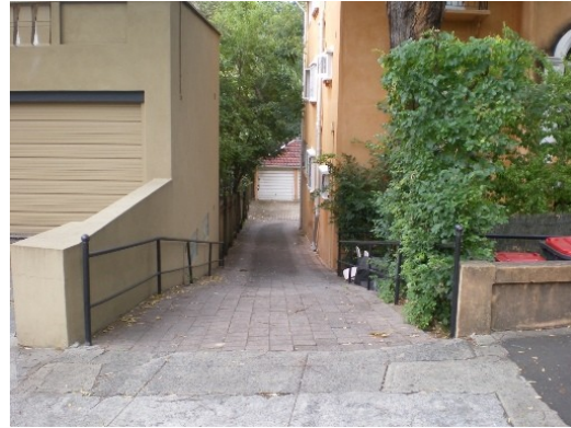
85. 63 Beresford Road Floor below road, Garage below road, Main flow channel bordering residence