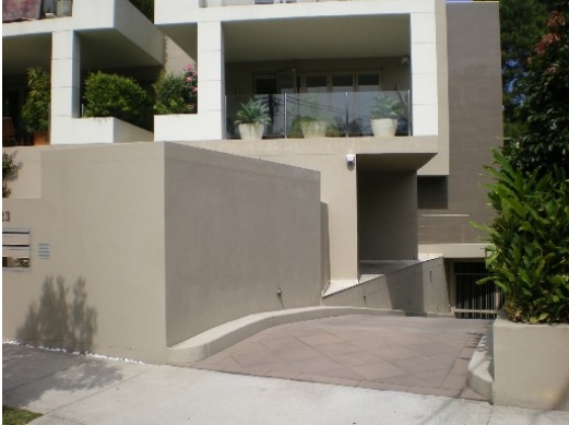
186. 223 O'Sullivan Road Garage below road, Flow diversion