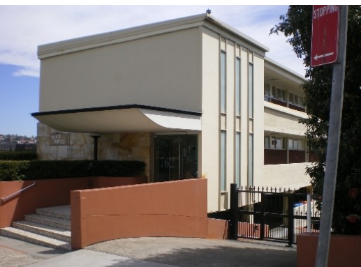
242. 762 New South Head Road Garage below road