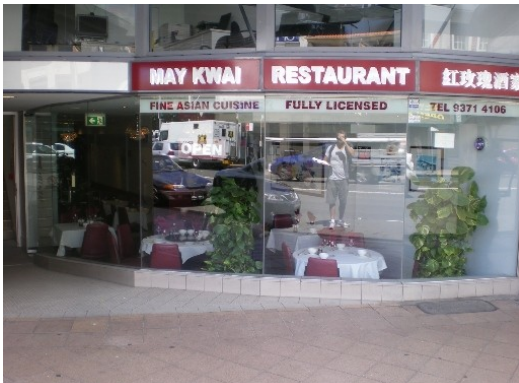
237. 710 New South Head Road Floor below road