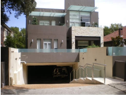
37. 18 Balfour Road Garage below road