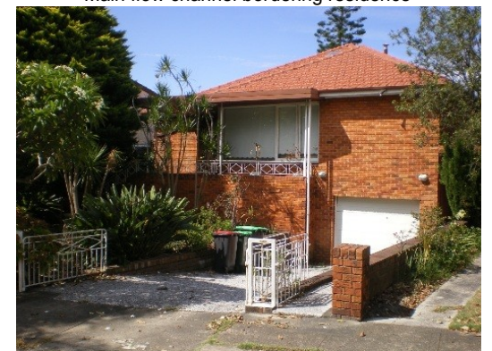
124. 77 Balfour Road Garage below road