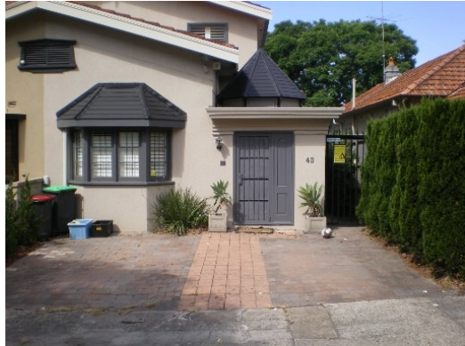
115. 43 Balfour Road Floor below road, Garage below road, Main flow channel bordering residence