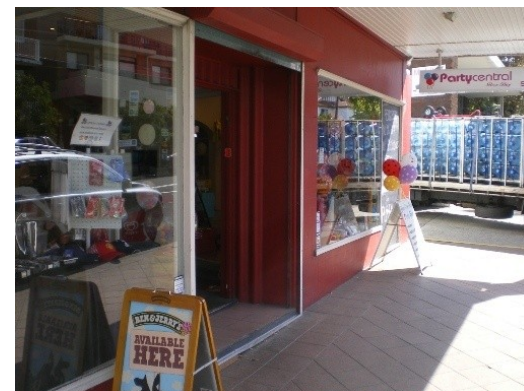
321. 532 Old South Head Road Floor below road