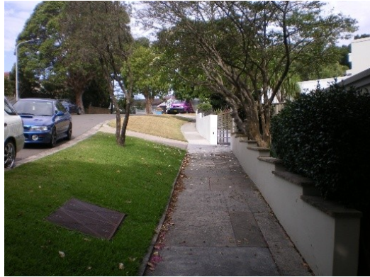
125. 29 Latimer Road Floor below road, Garage below road, Main flow channel bordering residence