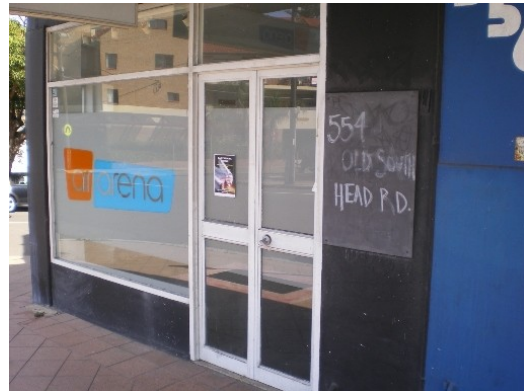
309. 554 Old South Head Road Floor below road