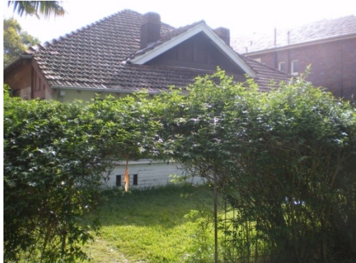
231. 6 Richmond Road Floor below road