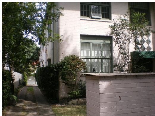
26. 71 O'Sullivan Road Floor below road, Garage below road