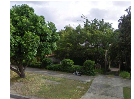
161. 55 Boronia Road Flooding due to overland flow from road above property