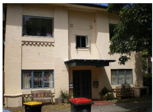
29. 4 Powell Road Floor below road