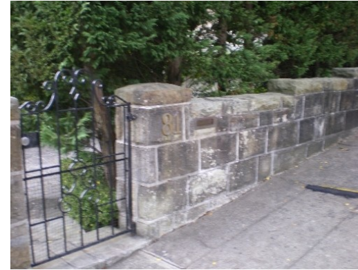
132. 81 Victoria Road Floor below road, Garage below road, Yard flooding