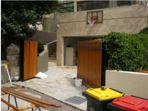
48. 7 Beresford Crescent Garage below road