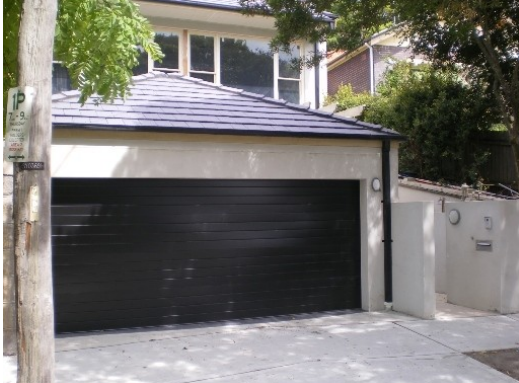
143. 155 O'Sullivan Road Garage below road