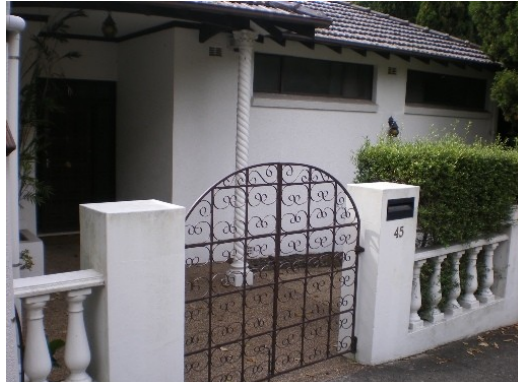
152. 45 Bunyula Road Floor below road