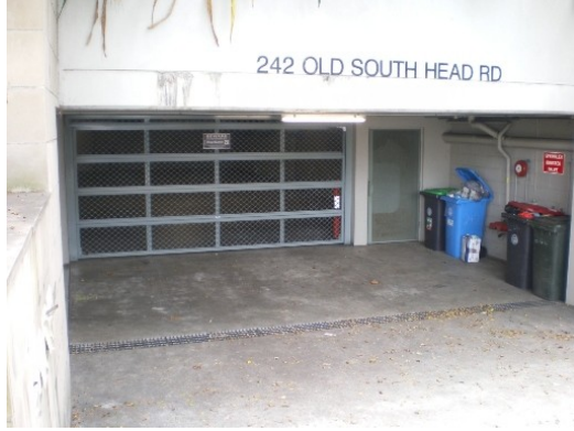
215. 242 Old South Head Road Garage below road