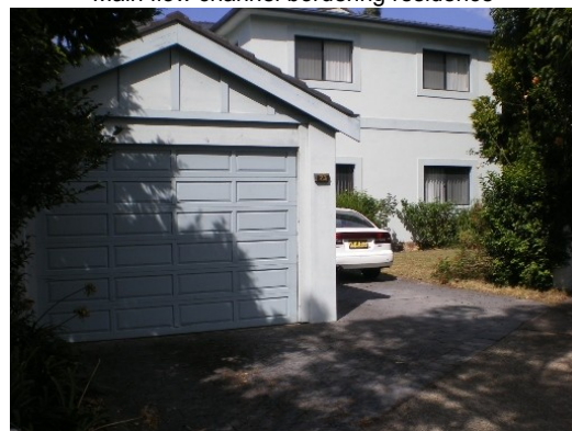
121. 73 Balfour Road Garage below road, Main flow channel bordering residence