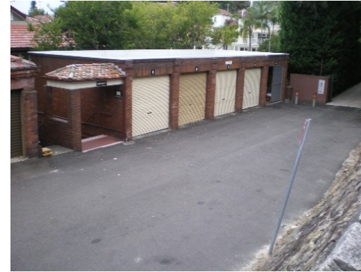
109. 90 Drumalbyn Road Floor below road, Garage below road, Ponding on street