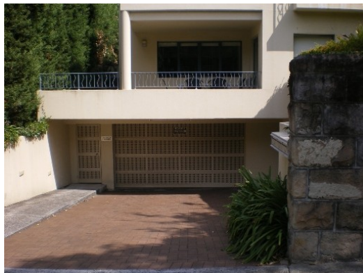
208. 21 Birriga Road Garage below road, Road and footpath graded towards residence, Main flow channel bordering residence