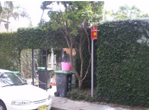
238. 2 Caledonian Road Floor below road