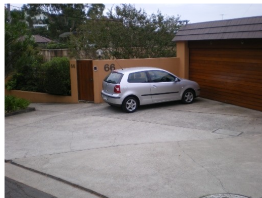
104. 66 Drumalbyn Road Floor below road, Garage below road, Flow diversion