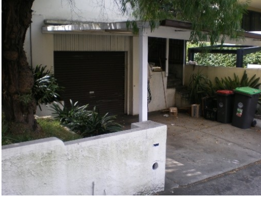
214. 202 Old South Head Road Garage below road