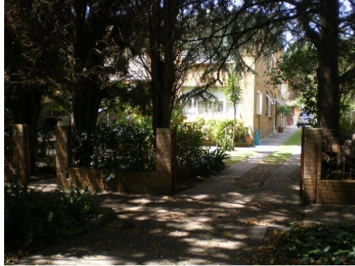
39. 23 Beresford Road Floor below road, Road and footpath graded towards residence