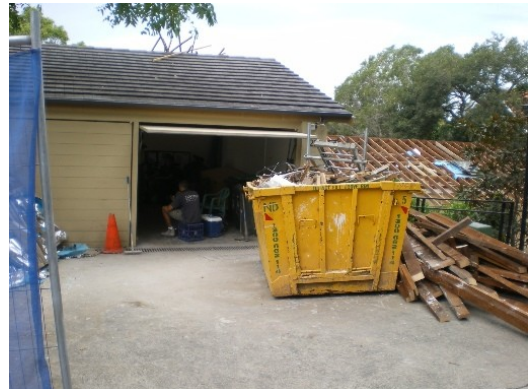
12. 22 Cranbrook Road Floor below road, Garage below road, Road and footpath graded towards residence