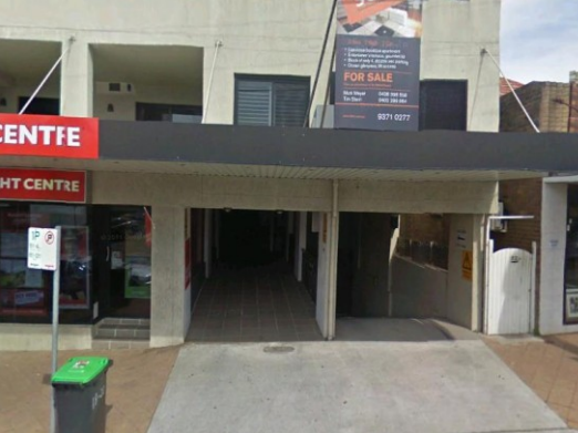
254. 16 Old South Head Road Garage below road