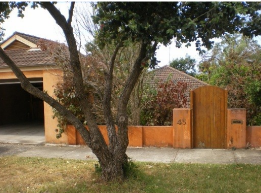
156. 45 Boronia Road Floor below road, Ponding on street, Flooding due to overland flow from road above property