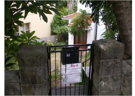
89. 71 Beresford Road Garage below road, Main flow channel bordering residence