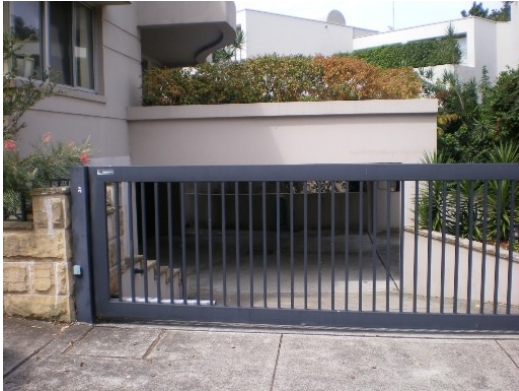
210. 17 Birriga Road Garage below road, Flooding due to overland flow from road, Road and footpath graded towards residence