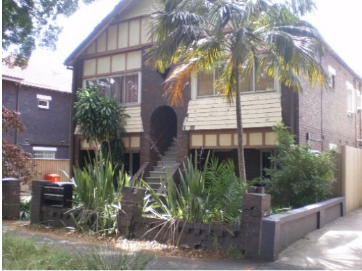
32. 13 Balfour Road Floor below road