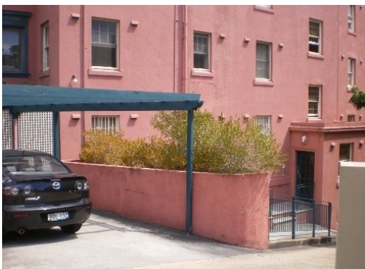
244. 776 New South Head Road Floor below road, Garage below road