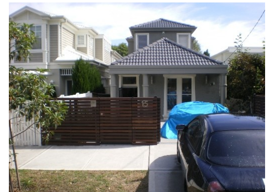
315. 15 Hamilton Street Floor below road, Flooding due to overland flow path from adjacent street