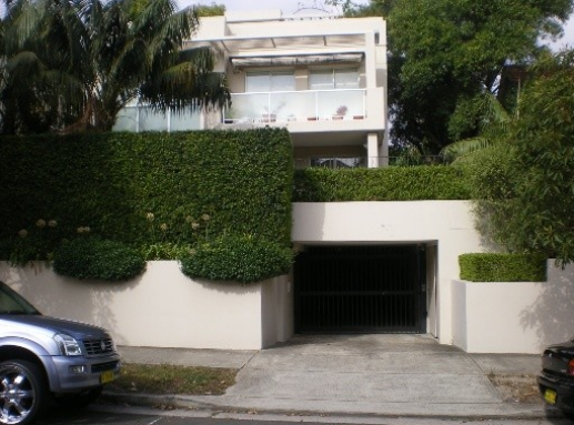
226. 9 Wilberforce Avenue Garage below road