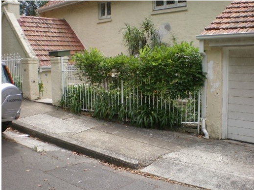
43. 4 Beresford Crescent Floor below road, Garage below road, Ponding on street, Flooding due to overland flow from road above property