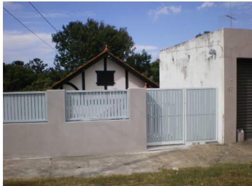
157. 47 Boronia Road Floor below road, Ponding on street, Flooding due to overland flow from road above property