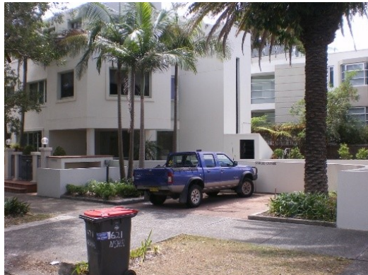
13. 621 New South Head Road Garage below road