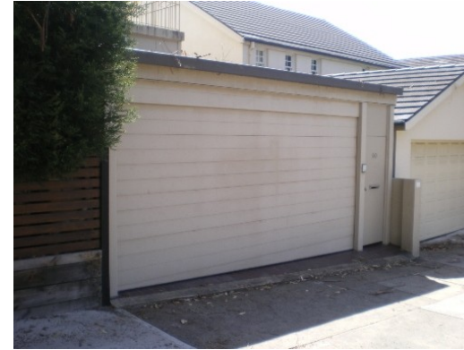
95. 90 Balfour Road Garage below road