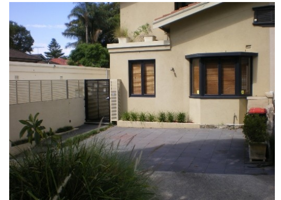
114. 43A Balfour Road Floor below road, Garage below road, Main flow channel bordering residence