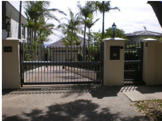
250. 36 Chamberlain Avenue Floor below road, Garage below road, Flooding due to overland flow path from adjacent street