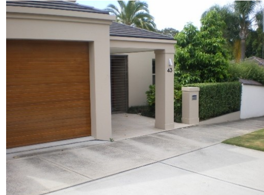
153. 43 Bunyula Road Floor below road