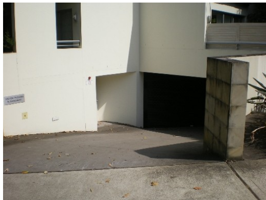
207. 23 Birriga Road Garage below road, Road and footpath graded towards residence, Main flow channel bordering residence