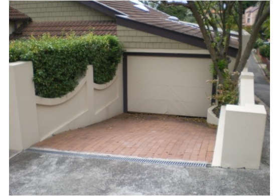
96. 79 Beresford Road Floor below road, Garage below road, Main flow channel bordering residence