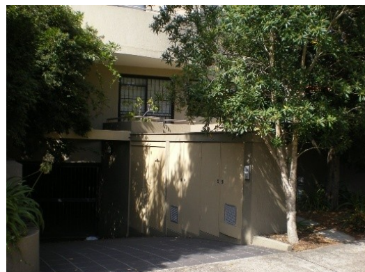
320. 40 Dover Road Garage below road, Flooding due to overland flow from road above property, Ponding on street