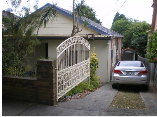
192. 23 Blaxland Road Floor below road