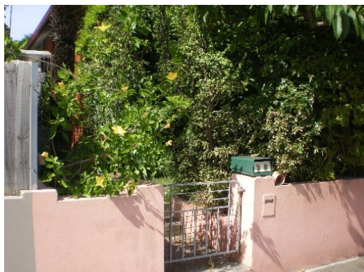
319. 38 Dover Road Flooding due to overland flow from road above property, Ponding on street