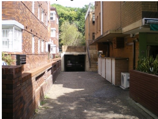
111. 95 O'Sullivan Road Garage below road