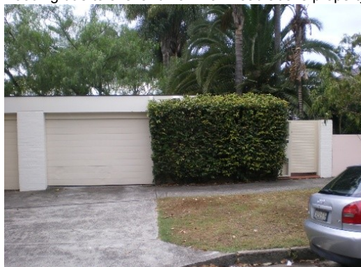
166. 13 Bunyula Road Floor below road, Ponding on street, No flow path, Flooding due to overland flow from road above property