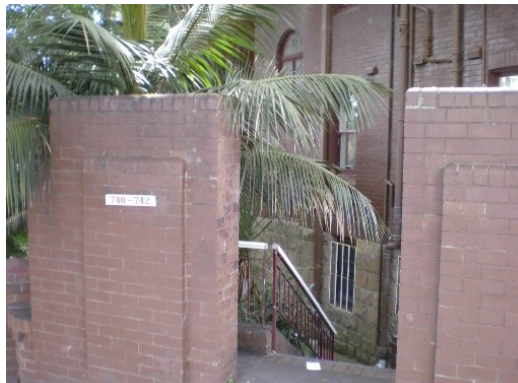
239. 740 New South Head Road Floor below road