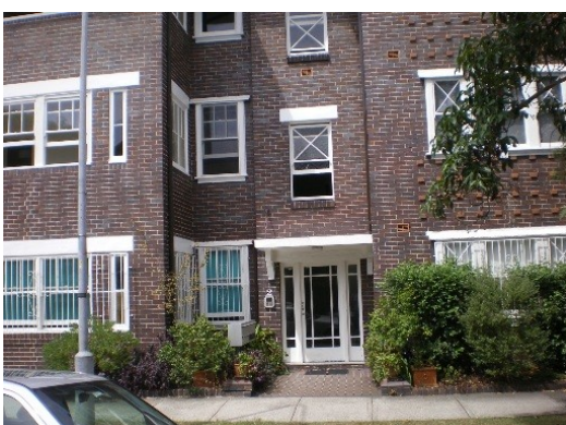
28. 2 Powell Road Floor below road