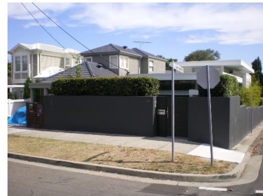
314. 11 Hamilton Street Floor below road, Garage below road, Flooding due to overland flow path from adjacent street