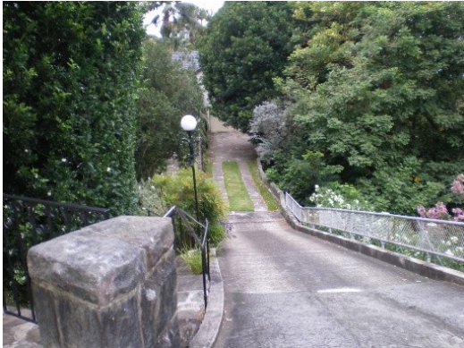
62. 34 Drimalbyn Road Floor below road, Garage below road