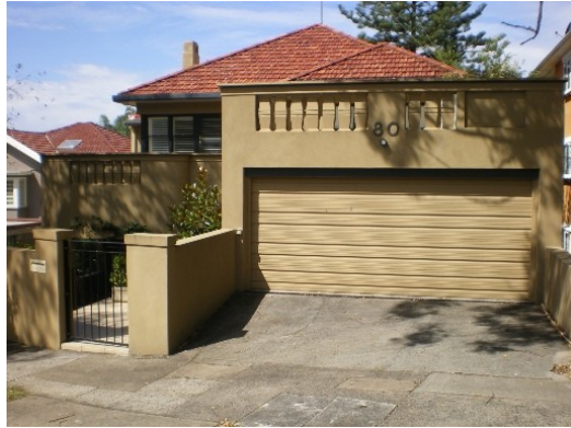
84. 80 Salisbury Road Floor below road, Garage below road, Main flow channel bordering residence