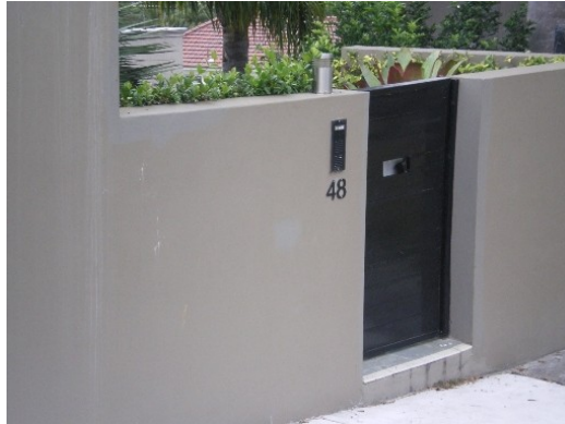
64. 48 Drimalbyn Road Floor below road, Garage below road