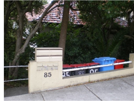
100. 85 Beresford Road Floor below road