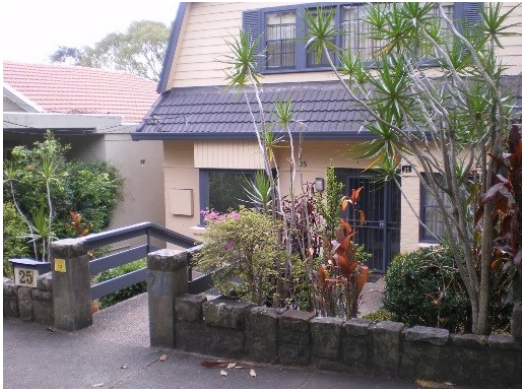
191. 25 Blaxland Road Floor below road