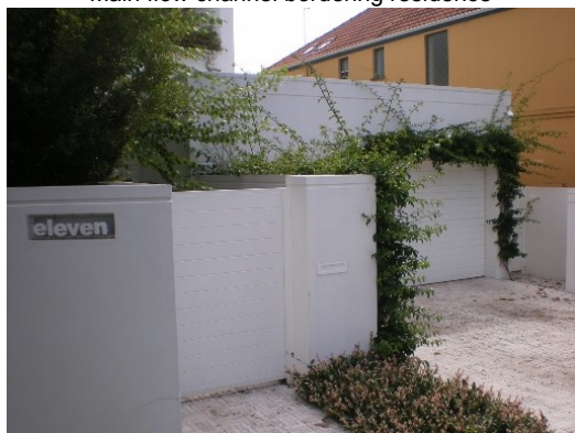
120. 11 Latimer Road Garage below road, Road and footpath graded towards residence