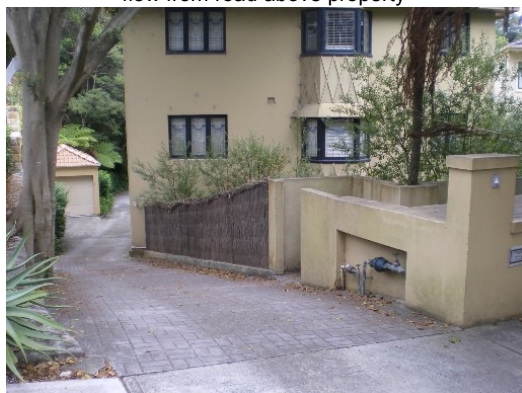
103. 106 Balfour Road Floor below road, Yard flooding