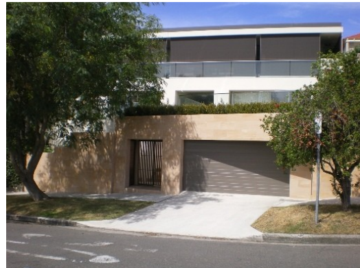
251. 2 Rawson Road Flooding due to overland flow from road above property