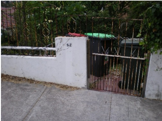
66. 52 Drumalbyn Road Floor below road