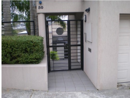
65. 50 Drimalbyn Road Floor below road, Garage below road