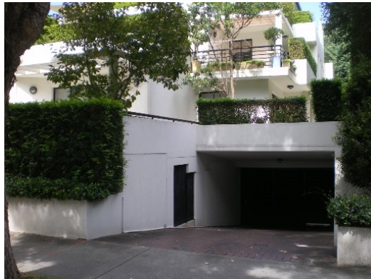
203. 239 O'Sullivan Road Garage below road