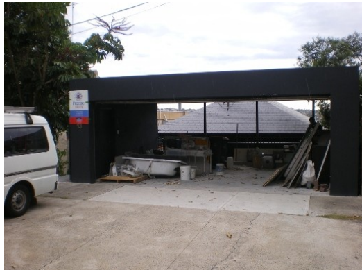
168. 17 Bunyula Road Floor below road, Ponding on street, No flow path, Flooding due to overland flow from road above property