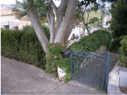
51. 48 Cranbrook Road Floor below road, Garage below road, Road and footpath graded towards residence