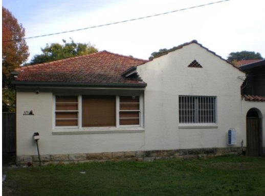
145. 171 O'Sullivan Road Flooding due to overland flow path from adjacent street