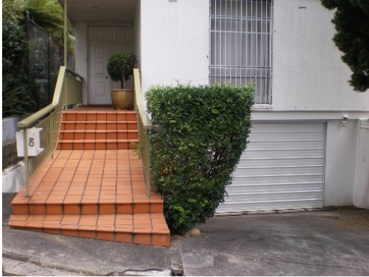
52. 8 Carrington Avenue Floor below road, Garage below road