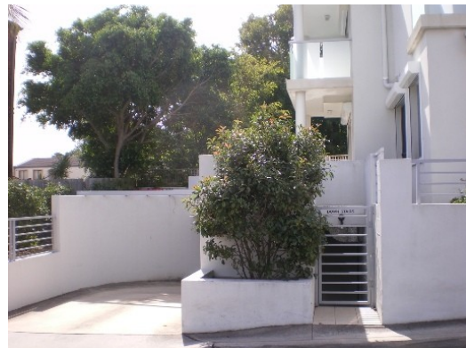
313. 7 Hamilton Street Floor below road, Garage below road, Flooding due to overland flow from road above property