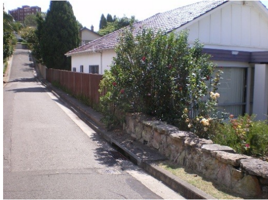
97. 94 Balfour Road Floor below road, Flooding due to overland flow from road above property