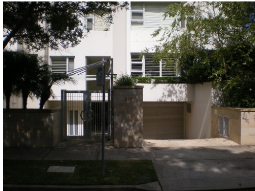
201. 247 O'Sullivan Road Floor below road, Garage below road