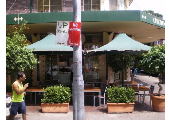
110. 89 O'Sullivan Road Floor below road