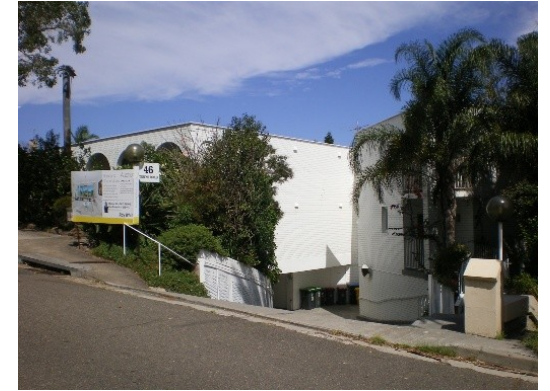
249. 46 Towns Road Garage below road