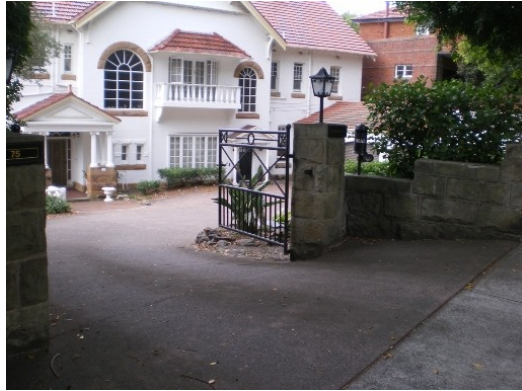
130. 75 Victoria Road Floor below road, Garage below road, Yard flooding