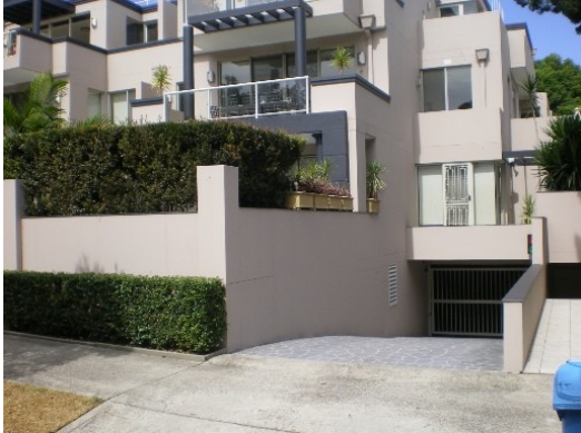
187. 229 O'Sullivan Road Garage below road