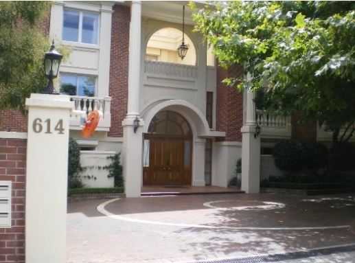
232. 614 New South Head Road Floor below road, Ponding on street