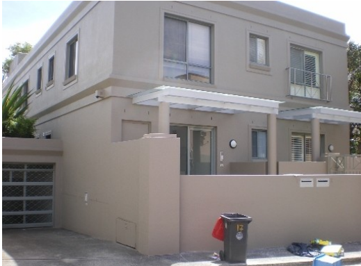
235. 17 Collins Avenue Garage below road