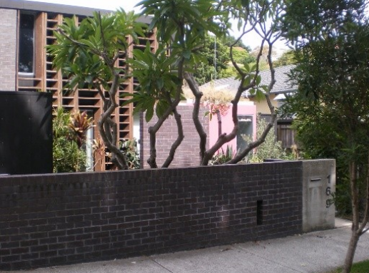
144. 169 O'Sullivan Road Floor below road, Flooding due to overland flow from road above property