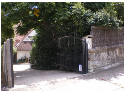
241. 750 New South Head Road Floor below road