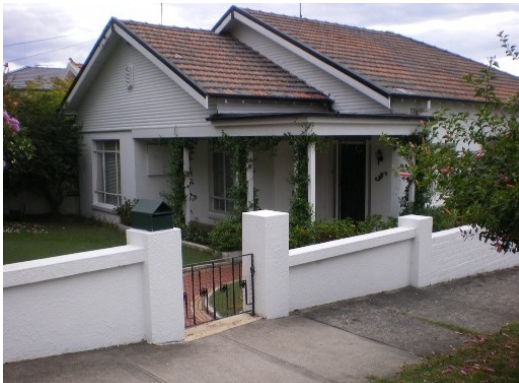
154. 33 Boronia Road Floor below road