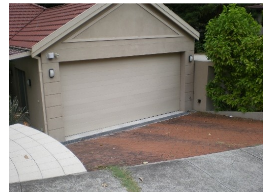
106. 112 Balfour Road Floor below road, Garage below road