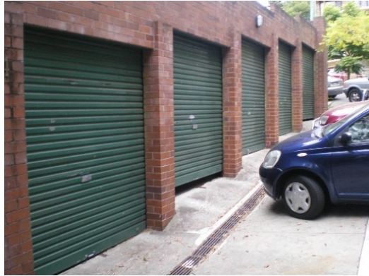
107. 84 Drumalbyn Road Floor below road, Garage below road, Road and footpath graded towards residence