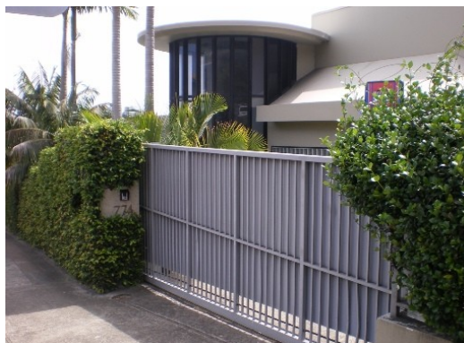
243. 774 New South Head Road Floor below road