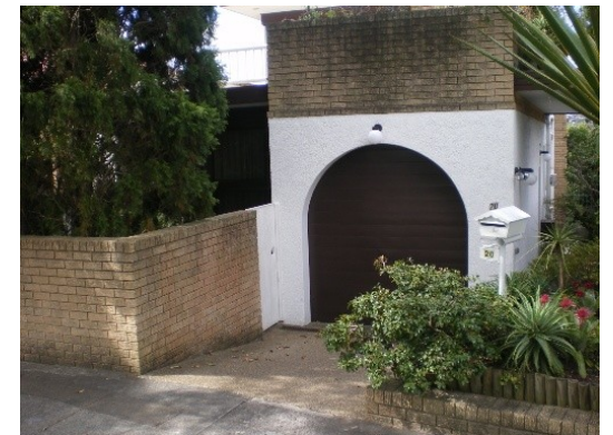
141. 20 Latimer Road Floor below road, Garage below road, Main flow channel bordering residence