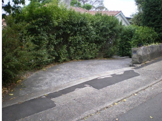
9. 10 Cranbrook Road Floor below road, Garage below road, Road and footpath graded towards residence