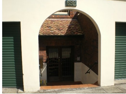
255. 692 Old South Head Road Floor below road