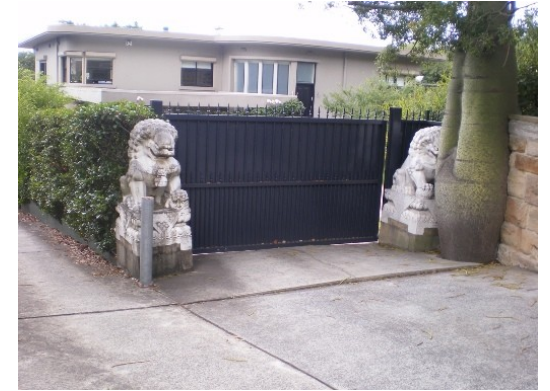
133. 85A Victoria Road Floor below road, Garage below road, Yard flooding