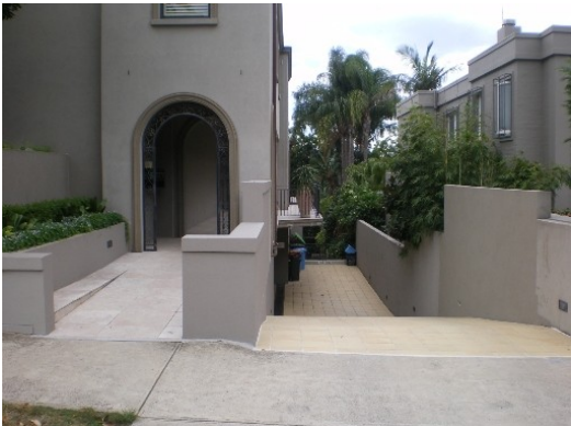
175. 17 Bundarra Road Floor below road, Garage below road