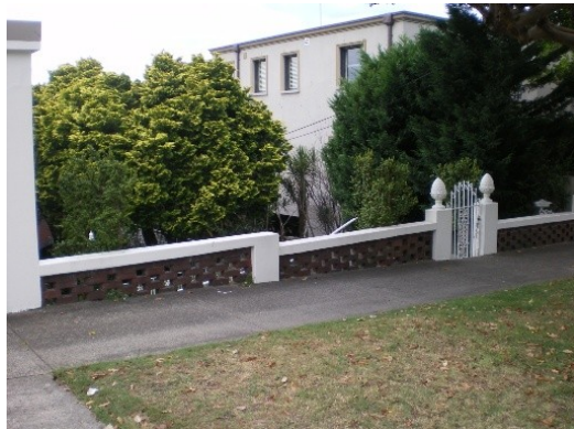
174. 19 Bundarra Road Floor below road, Garage below road