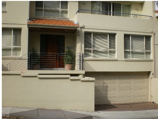
285. 19 Fernleigh Avenue Garage below road