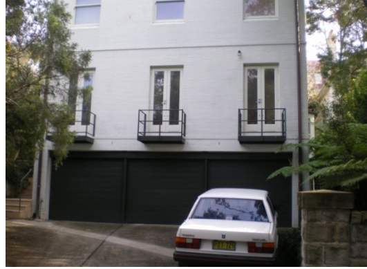
3. 5 Cranbrook Road Floor below road