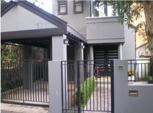
147. 175 O'Sullivan Road Flooding due to overland flow path from adjacent street