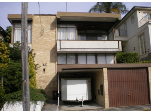
162. 64 Boronia Road Flooding due to overland flow path from adjacent street