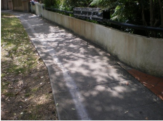
197. 94A Birriga Road Floor below road, Main flow channel bordering residence