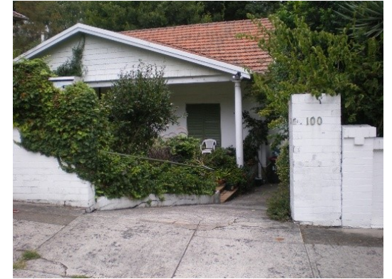
101. 100 Balfour Road Floor below road, Yard flooding