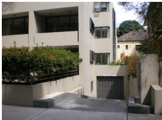
27. 69 O'Sullivan Road Garage below road