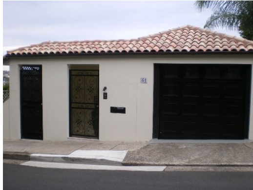
49. 44 Cranbrook Road Floor below road, Garage below road, Road and footpath graded towards residence