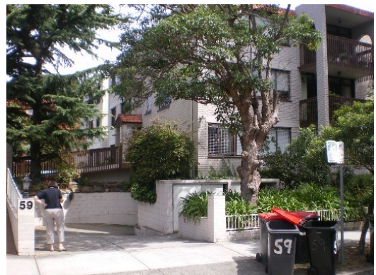
17. 59 O'Sullivan Road Garage below road