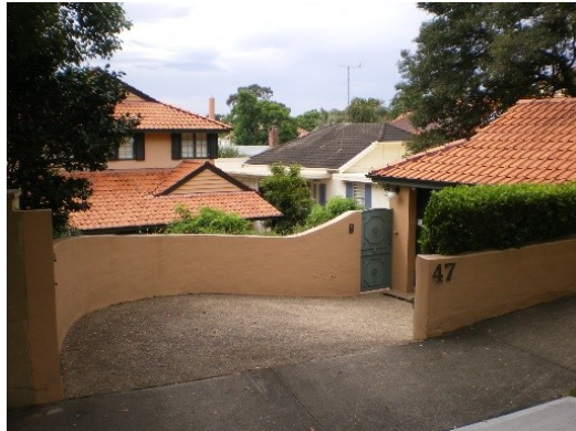
68. 47 Beresford Road Floor below road, Garage below road, Road and footpath graded towards residence, Flow diversion