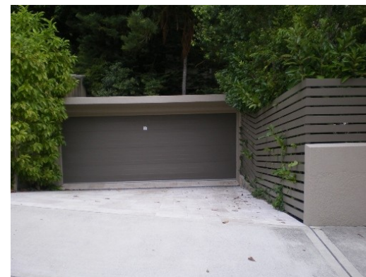
105. 110 Balfour Road Garage below road