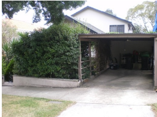
188. 31B Blaxland Road Floor below road