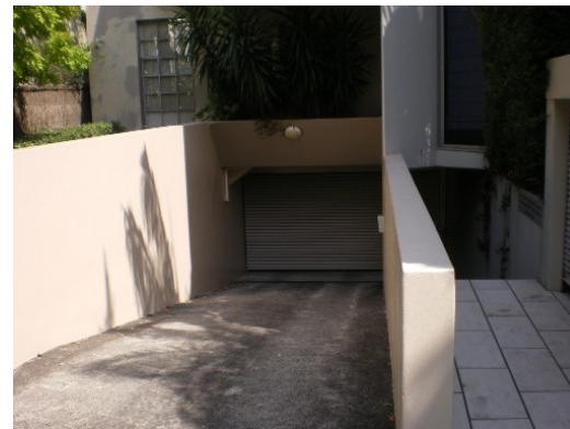
209. 19 Birriga Road Garage below road, Road and footpath graded towards residence, Main flow channel bordering residence