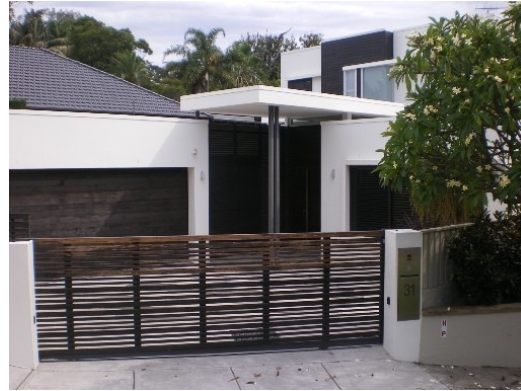
126. 31 Latimer Road Floor below road, Garage below road, Main flow channel bordering residence