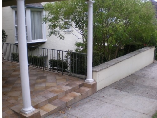
56. 2 Drimalbyn Road Floor below road