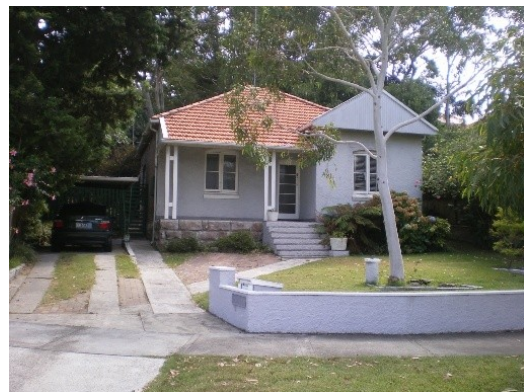
260. 12 Mitchell Road Flooding due to overland flow from road above property