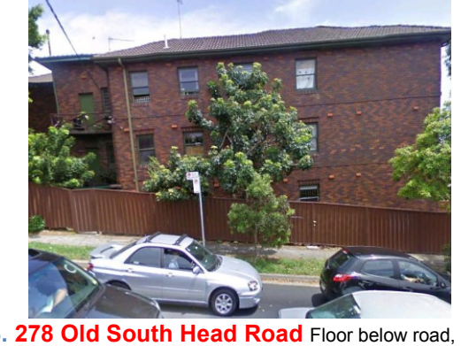
218. 278 Old South Head Road Floor below road, Road / footpath graded towards residence, Flooding from road, overland flow