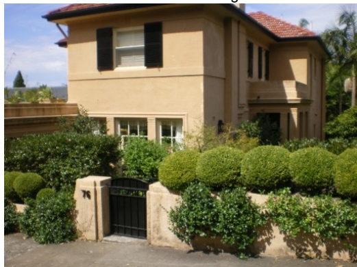
82. 76 Salisbury Road Floor below road, Garage below road, Main flow channel bordering residence