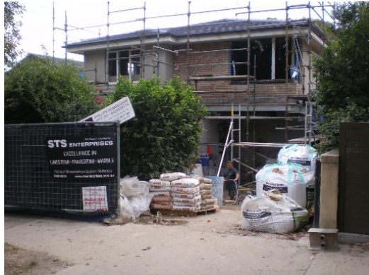
189. 29 Blaxland Road Floor below road