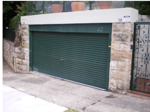
135. 43 Drumalbyn Road Garage below road