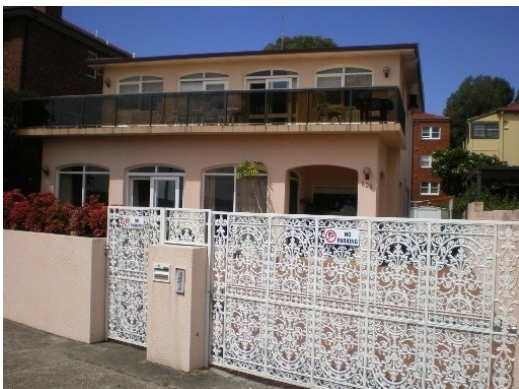
16. 635 New South Head Road Floor below road