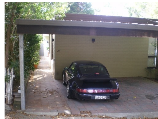
260. 29 Ebsworth Road Floor below road, Main flow channel bordering residence