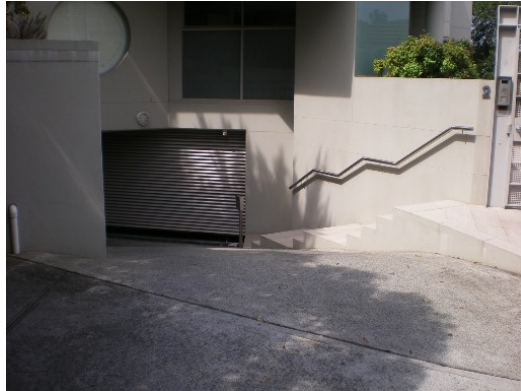
211. 2 Banksia Road Garage below road, Road and footpath graded towards residence