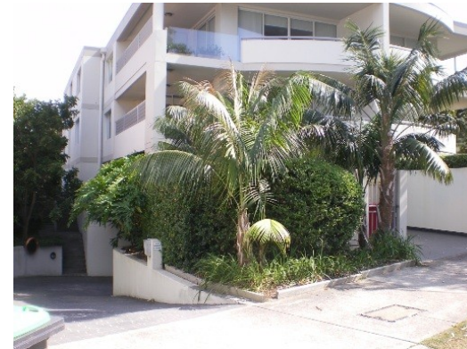
310. 566 Old South Head Road Garage below road