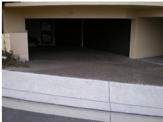
138. 87 Drumalbyn Road Garage below road