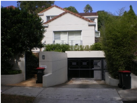
200. 255 O'Sullivan Road Garage below road