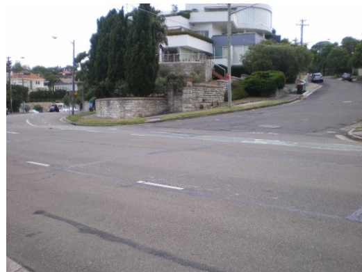
139. 127 Victoria Road Ponding on street, High velocity flow, No flow path