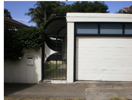
113. 41 Balfour Road Floor below road, Garage below road, Main flow channel bordering residence