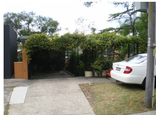
167. 15 Bunyula Road Floor below road, Ponding on street, No flow path, Flooding due to overland flow from road above property