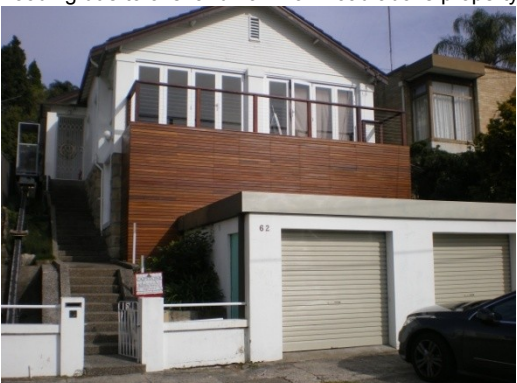
163. 62 Boronia Road Flooding due to overland flow path from adjacent street