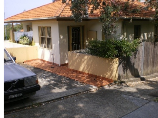
213. 194 Old South Head Road Floor below road, Flooding due to overland flow from road above property