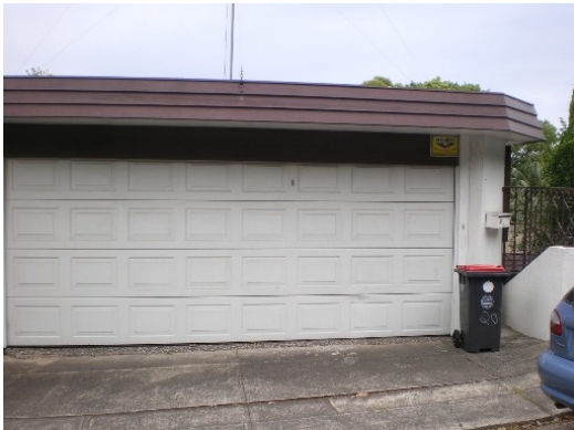
11. 20 Cranbrook Road Floor below road, Garage below road, Road and footpath graded towards residence