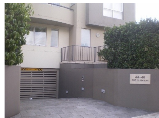
334. 44 Wilberforce Avenue Garage below road