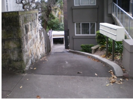
194. 80 Birriga Road Floor below road, Garage below road, Road and footpath graded towards residence, Main flow channel bordering residence