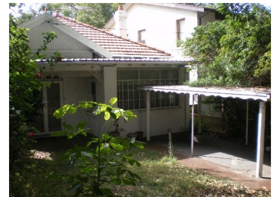
263. 27 Ebsworth Road Floor below road, Main flow channel bordering residence