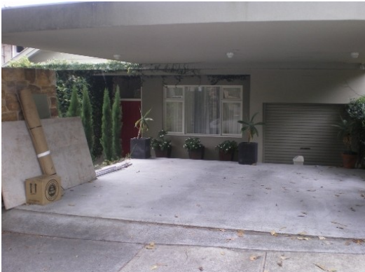
190. 27 Blaxland Road Floor below road, Garage below road