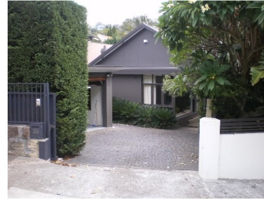
127. 33 Latimer Road Floor below road, Garage below road, Main flow channel bordering residence