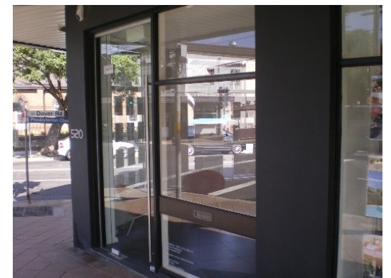
322. 520 Old South Head Road Floor below road