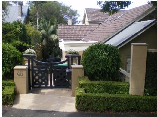
69. 45 Beresford Road Floor below road, Road and footpath graded towards residence, Flow diversion