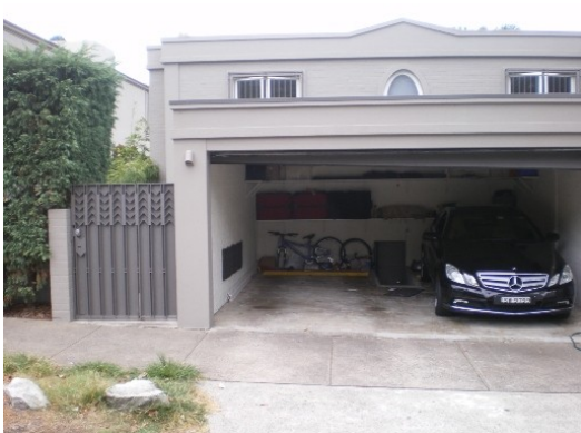
176. 15 Bundarra Road Floor below road, Garage below road, Ponding on street, Flooding due to overland flow from road