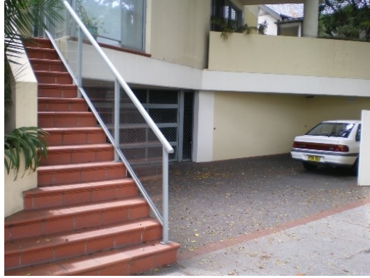
216. 244 Old South Head Road Garage below road