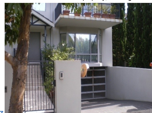
324. 65 Dover Road Garage below road, Ponding on street