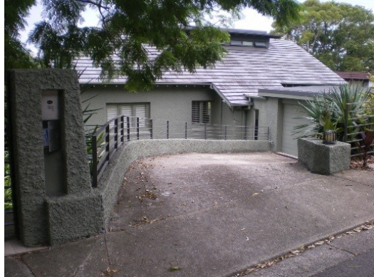
10. 18 Cranbrook Road Garage below road