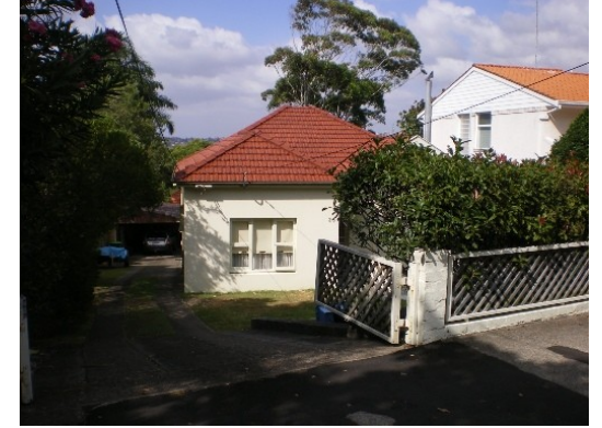
257. 35 Dudley Road Flooding due to overland flow path from adjacent street