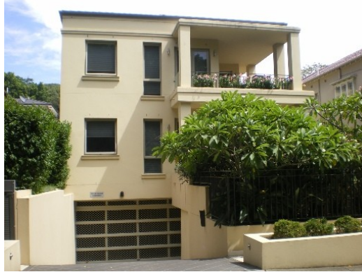
41. 37 Salisbury Road Garage below road