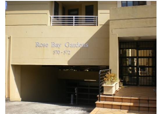
311. 570 Old South Head Road Garage below road