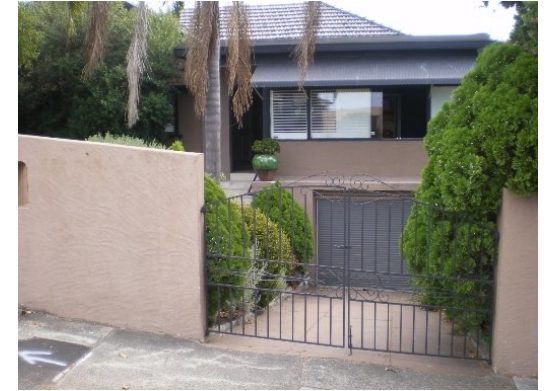
128. 35 Latimer Road Garage below road, Main flow channel bordering residence