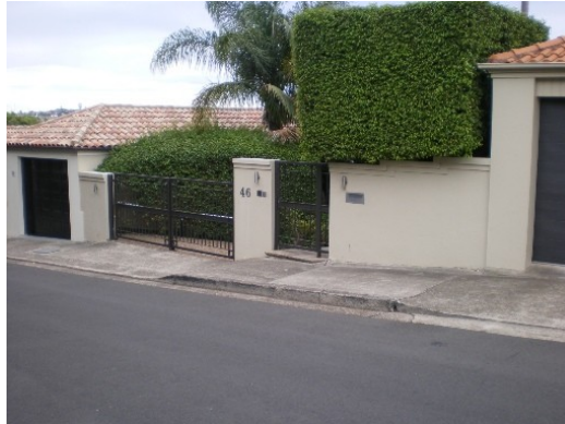
50. 46 Cranbrook Road Floor below road, Garage below road, Road and footpath graded towards residence