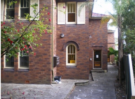
230. 10 Richmond Road Floor below road