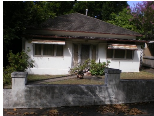
112. 35 Balfour Road Floor below road, Garage below road