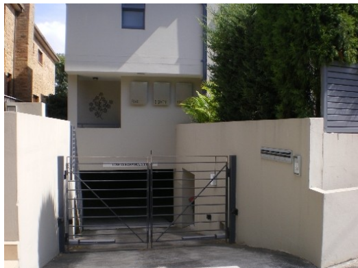
312. 586 Old South Head Road Garage below road