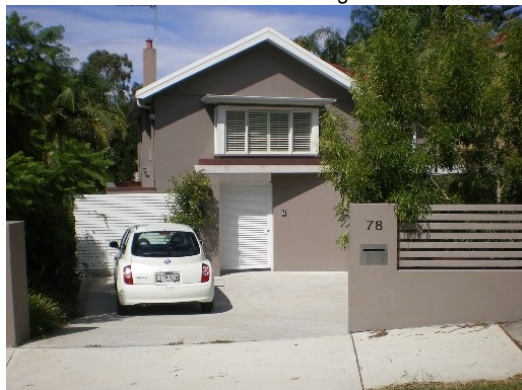
83. 78 Salisbury Road Floor below road, Garage below road, Main flow channel bordering residence