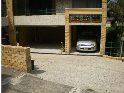
212. 4 Banksia Road Floor below road, Road and footpath graded towards residence