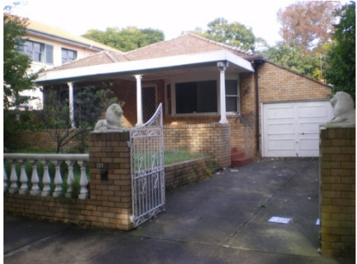
150. 181 O'Sullivan Road Flooding due to overland flow path from adjacent street