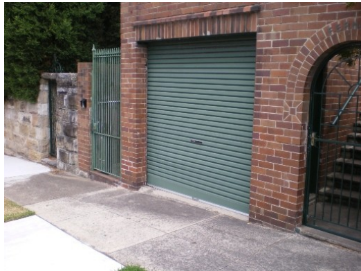
134. 41 Drumalbyn Road Garage below road