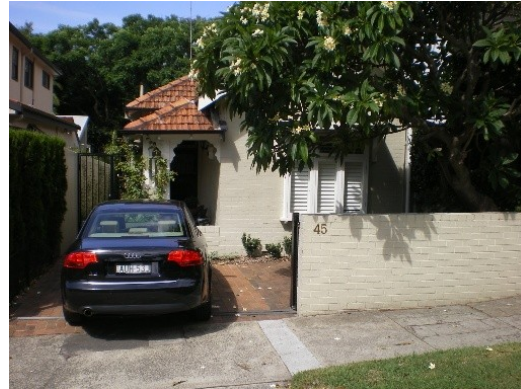
116. 45 Balfour Road Floor below road, Garage below road, Main flow channel bordering residence