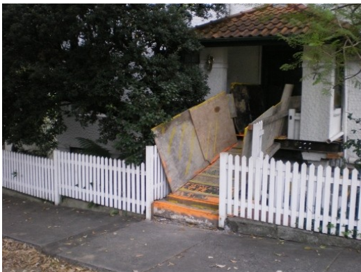
206. 73 Birriga Road Floor below road, Road and footpath graded towards residence