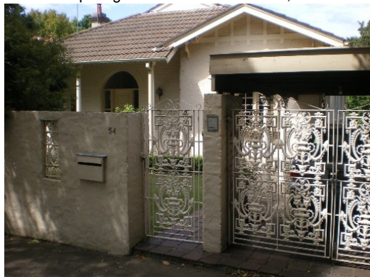
73. 54 Salisbury Road Floor below road, Garage below road, Main flow channel bordering residence