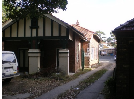
229. 12 Richmond Road Floor below road