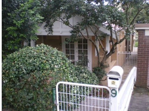
179. 9 Bundarra Road Floor below road, Garage below road, Ponding on street