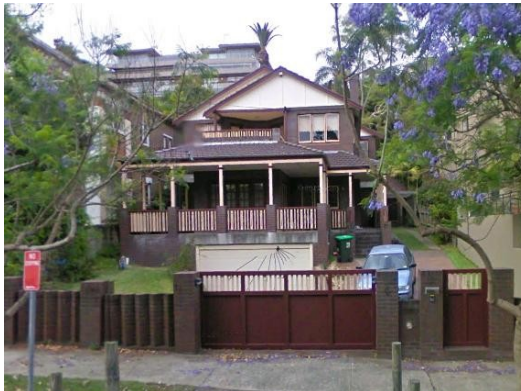
204. 4 Bundarra Road Flooding due to overland flow path from adjacent street