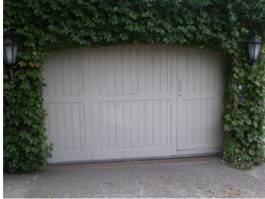
57. 6 Drimalbyn Road Garage below road