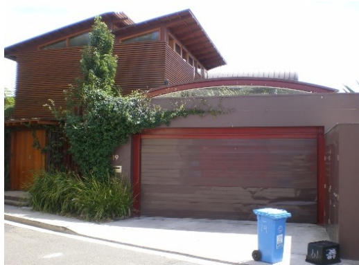
234. 19 Collins Avenue Garage below road