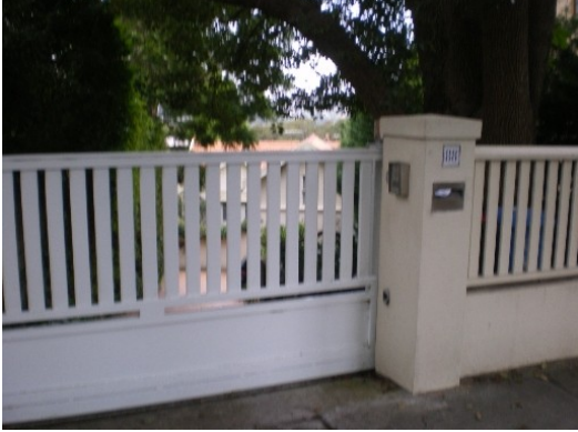
195. 88 Birriga Road Floor below road, Garage below road, Road and footpath graded towards residence, Main flow channel bordering residence