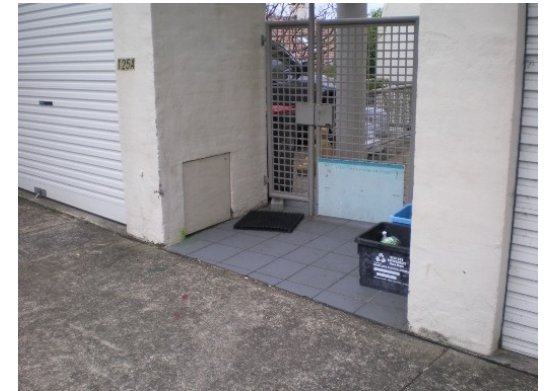
137. 125A Victoria Road Floor below road, Ponding on street