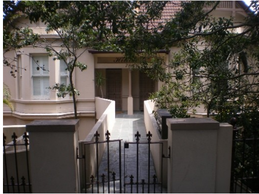
245. 780 New South Head Road Floor below road