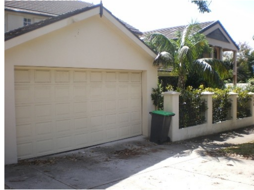
94. 88 Balfour Road Garage below road