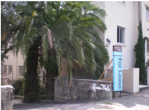
240. 748 New South Head Road Floor below road