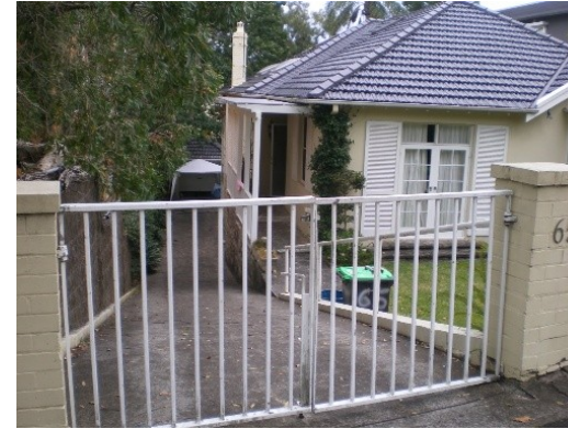
87. 65 Beresford Road Floor below road, Garage below road, Main flow channel bordering residence