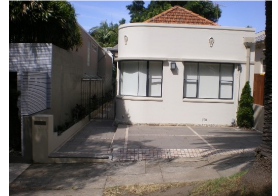
119. 51 Balfour Road Floor below road, Garage below road, Main flow channel bordering residence