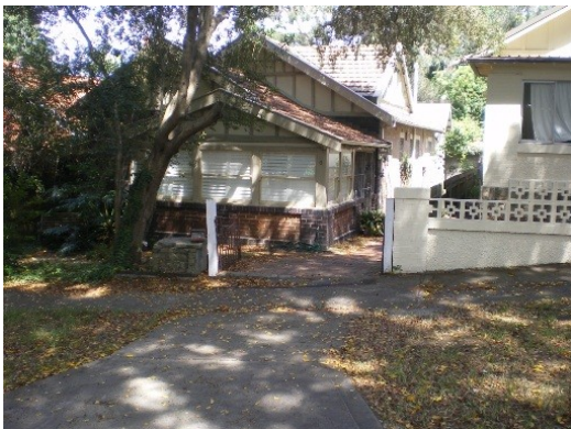
70. 6 Plumer Road Floor below road, Yard flooding