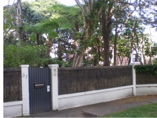
256. 37 Dudley Road Flooding due to overland flow path from adjacent street