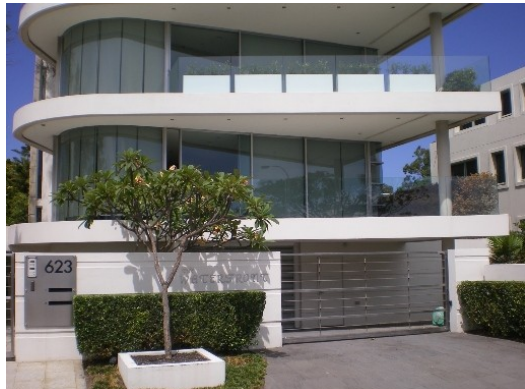
14. 623 New South Head Road Garage below road