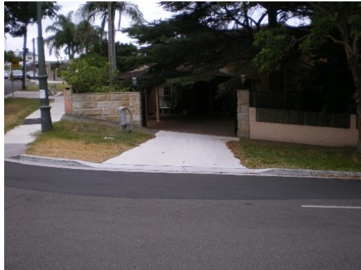
67. 54 Drumalbyn Road Floor below road, Garage below road