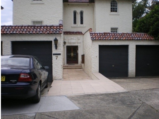
2. 597 New South Head Road Garage below road