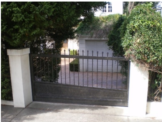
77. 64 Salisbury Road Floor below road, Yard flooding, Main flow channel bordering residence