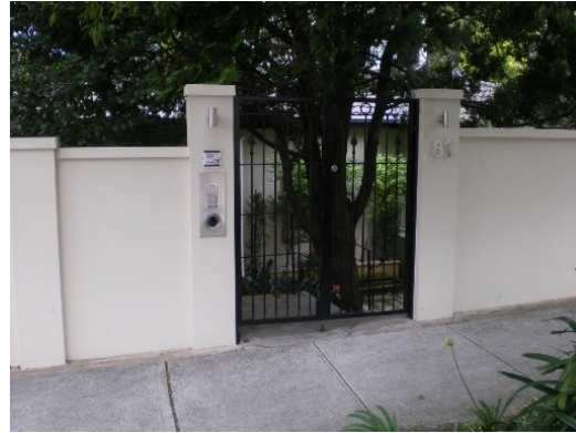
98. 81 Beresford Road Floor below road