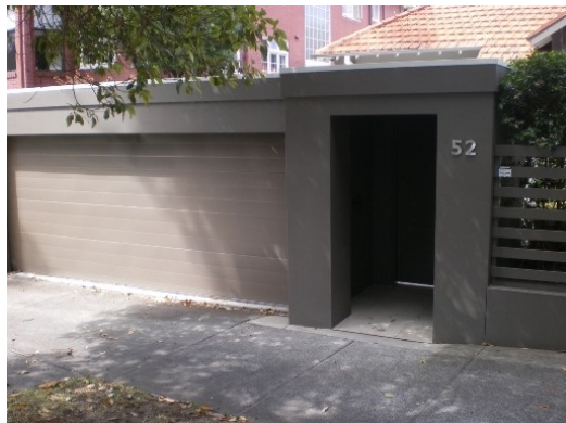
72. 52 Salisbury Road Floor below road, Garage below road, Main flow channel bordering residence