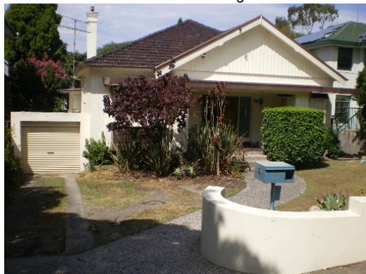
79. 70 Salisbury Road Floor below road, Garage below road, Main flow channel bordering residence