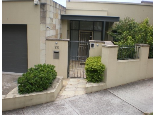
90. 73 Beresford Road Floor below road, Garage below road, Main flow channel bordering residence