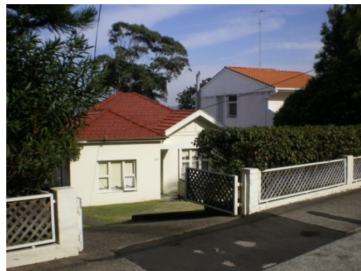
258. 35 Dudley Street Floor below road, Flow diversion