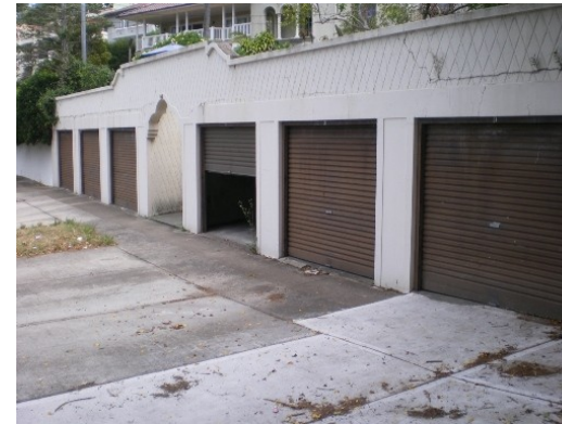
136. 49 Drumalbyn Road Garage below road, Ponding on street