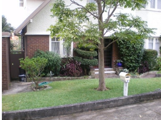
180. 7 Bundarra Road Floor below road, Garage below road, Ponding on street