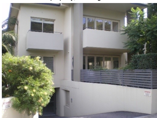
323. 69 Dover Road Garage below road, Ponding on street