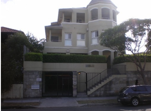
224. 4 Albemarle Avenue Garage below road