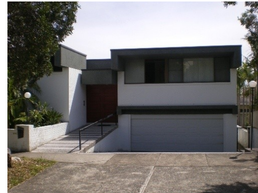
252. 34 Chamberlain Avenue Garage below road, Flooding due to overland flow from road above property