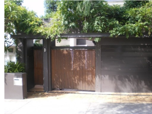
117. 47 Balfour Road Floor below road, Garage below road, Main flow channel bordering residence