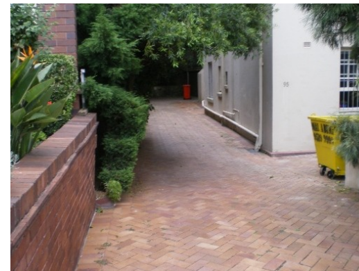
140. 95 Drumalbyn Road Garage below road, Yard flooding