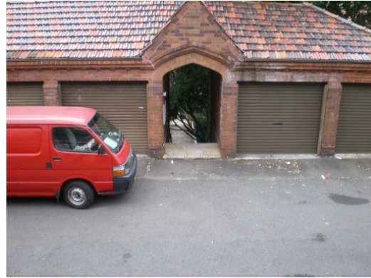
108. 88 Drumalbyn Road Floor below road, Garage below road, Ponding on street