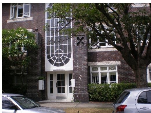
30. 9 Balfour Road Floor below road