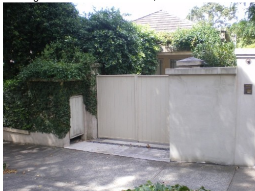
74. 56 Salisbury Road Floor below road, Garage below road, Main flow channel bordering residence