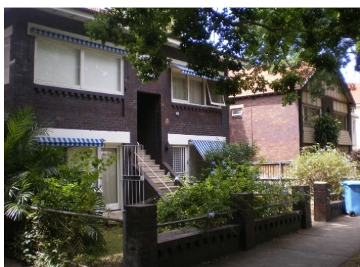
31. 11 Balfour Road Floor below road