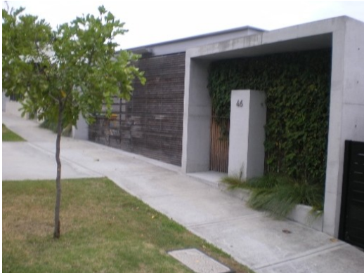
63. 46 Drimalbyn Road Floor below road, Garage below road