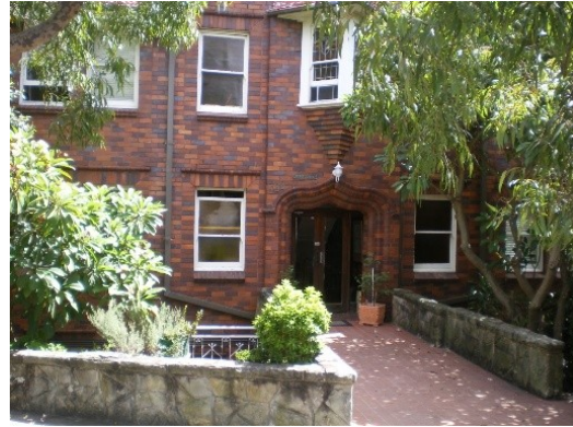
246. 788 New South Head Road Floor below road