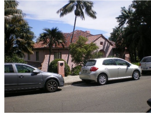
247. 6 Tivoli Avenue Floor below road, Ponding on street