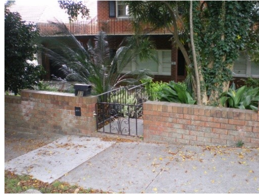
131. 77 Victoria Road Floor below road