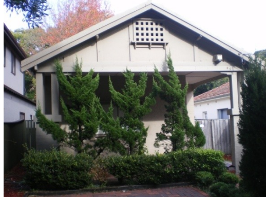
146. 173 O'Sullivan Road Flooding due to overland flow path from adjacent street