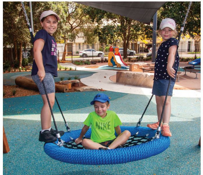
The new Plumb Reserve Playground

The following table provides a snapshot of the status of the progress of all Actions as at 31 December 2021.