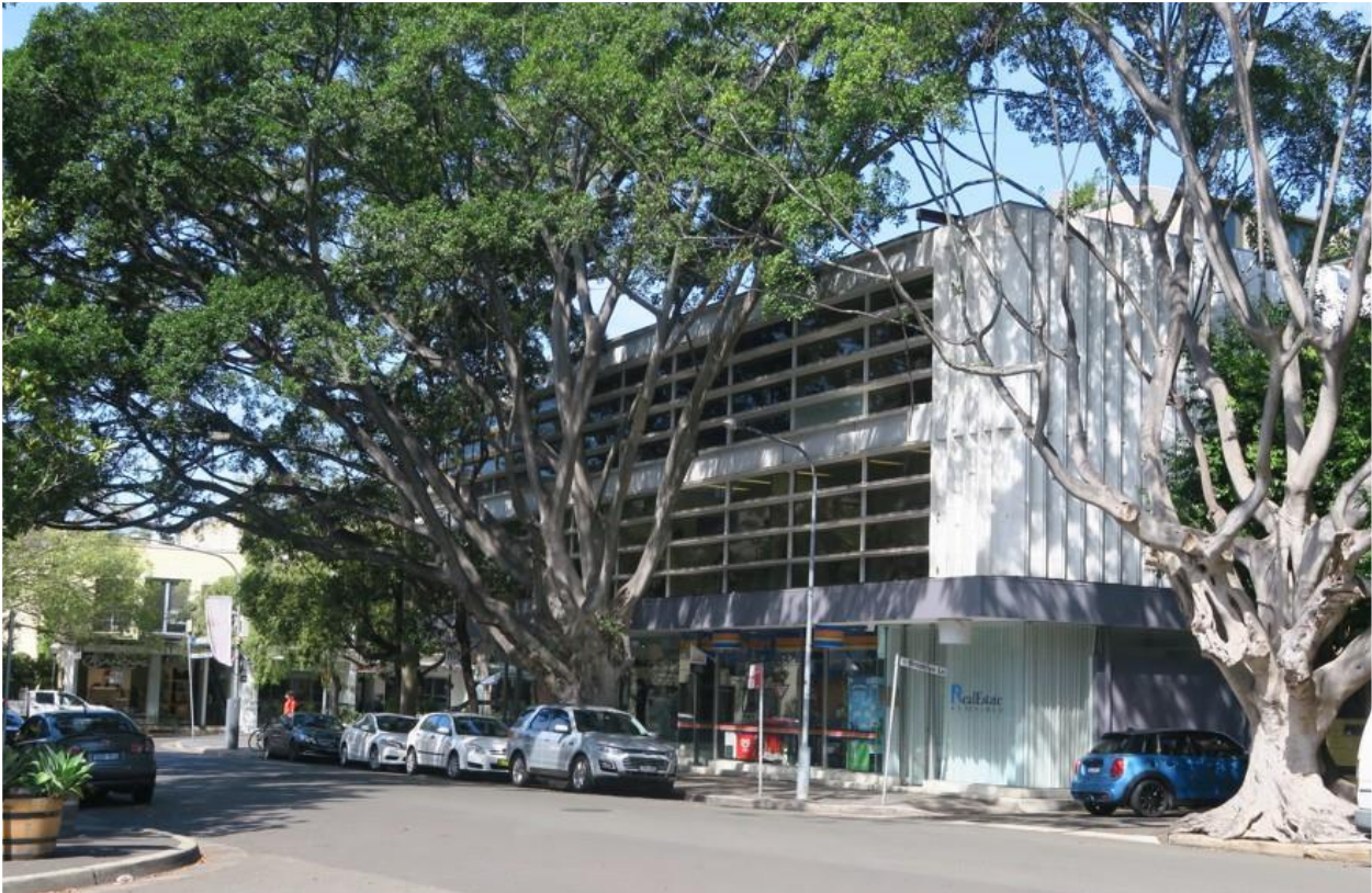
Figure 1: Gaden House viewed from South Avenue, looking towards north and west elevation and Brooklyn Lane