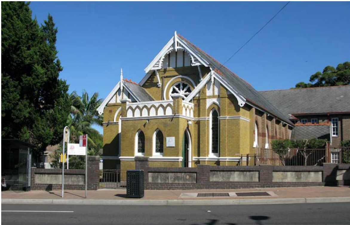
Figure 1: Rose Bay Methodist Church (1904) and the Wesley Hall (1929), (Source: RA Moore February 2018).

Rose Bay Uniting Church and Wesley Hall Group – church and interiors (including moveable heritage, vestry and 1924 additions), Wesley Hall and interiors.