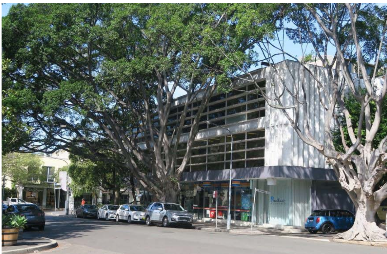
Figure 1: Gaden House viewed from South Avenue, looking towards north and west elevation and Brooklyn Lane

Gaden House was designed in 1969 by Sydney architect, Neville Gruzman, and was opened by Premier Askin in 1971. The ground floor level is raised above street level and was designed with seven retail tenancies, five facing Cooper Street and two facing Bay Street. A lobby extends from the Cooper Street frontage to a spiral stair linking the ground floor to the two upper storeys, which are currently used as offices. A separate, external staircase allows access to the lower ground level, which was originally designed for D’Arcy’s restaurant and one retail tenancy. Pelicano’s restaurant now occupies the entire basement level.