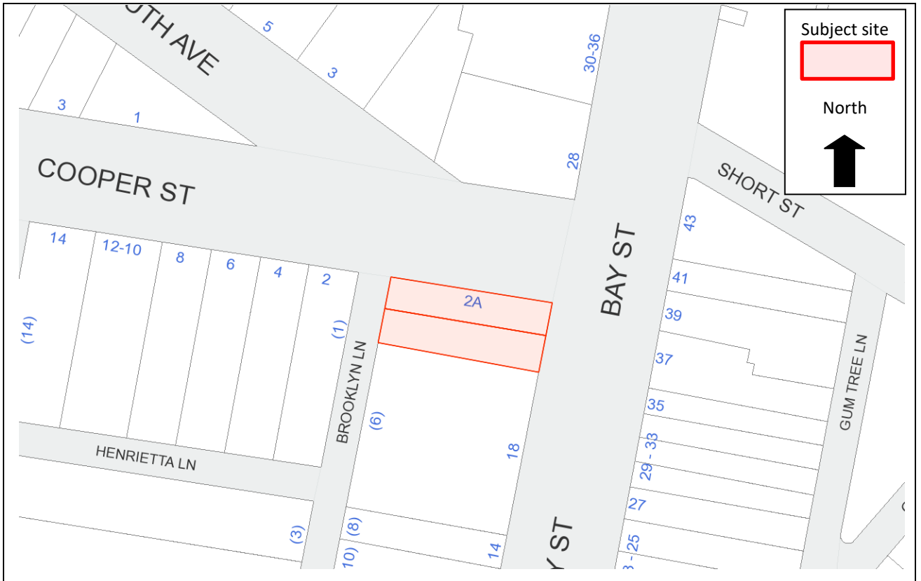
Figure 2: Cadastral map showing Gaden House site outlined in red