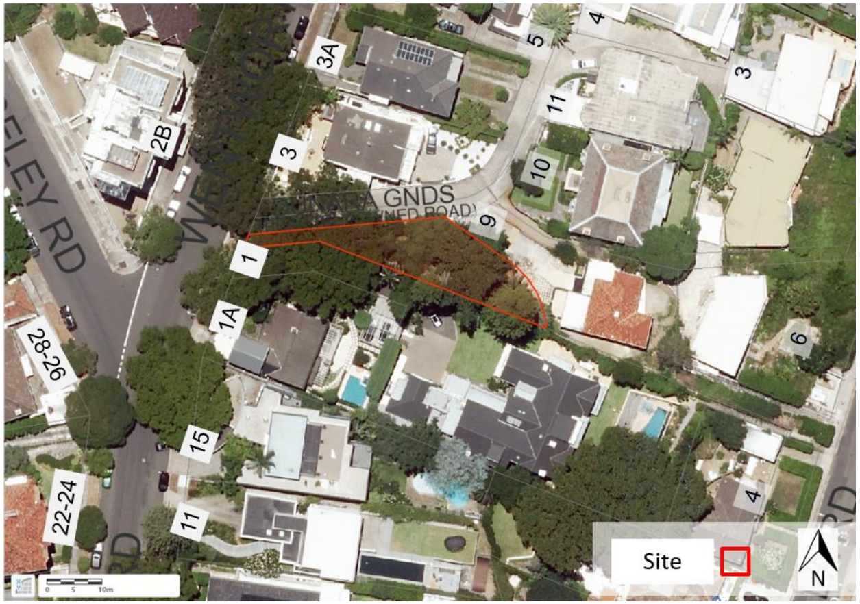
Figure 2: Aerial photograph showing Dunara Reserve outlined in red