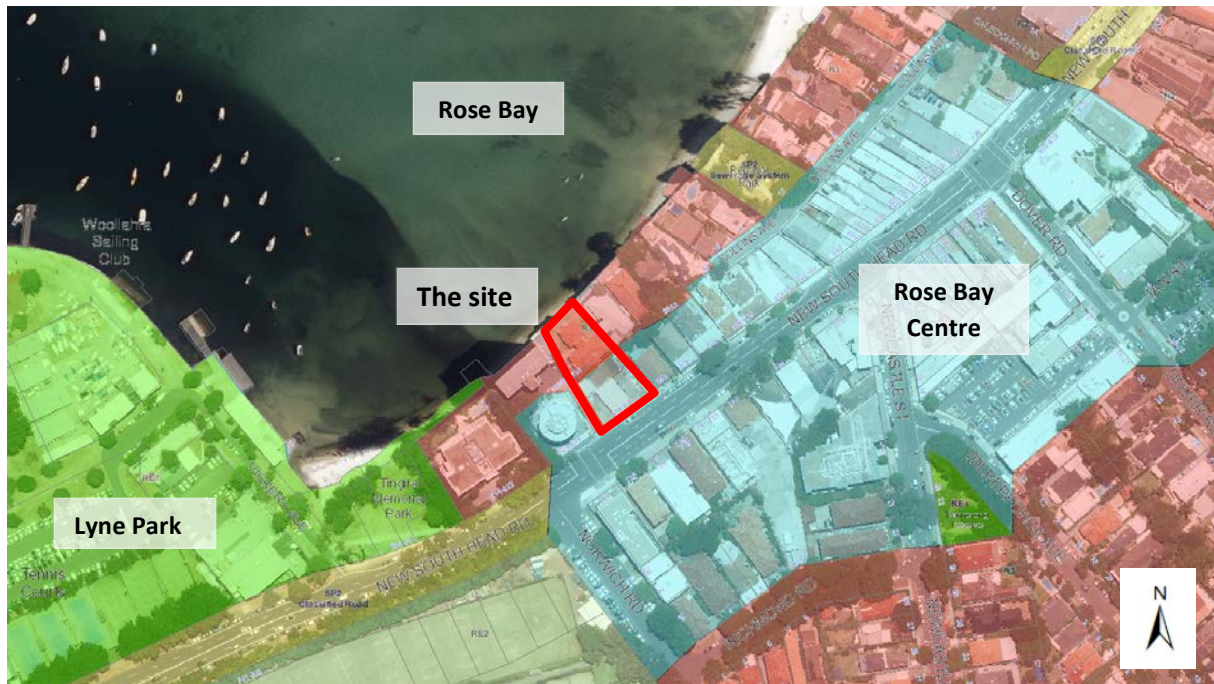
Figure 1: Local area map (the site is shown with a red outline on an aerial photograph with a WLEP 2014 zoning map overlay)

The site is located on the north (bay) side of New South Head Road, Rose Bay, as shown below in Figure 1. It is located approximately 140m from Lyne Park and is partially within the Rose Bay Centre.