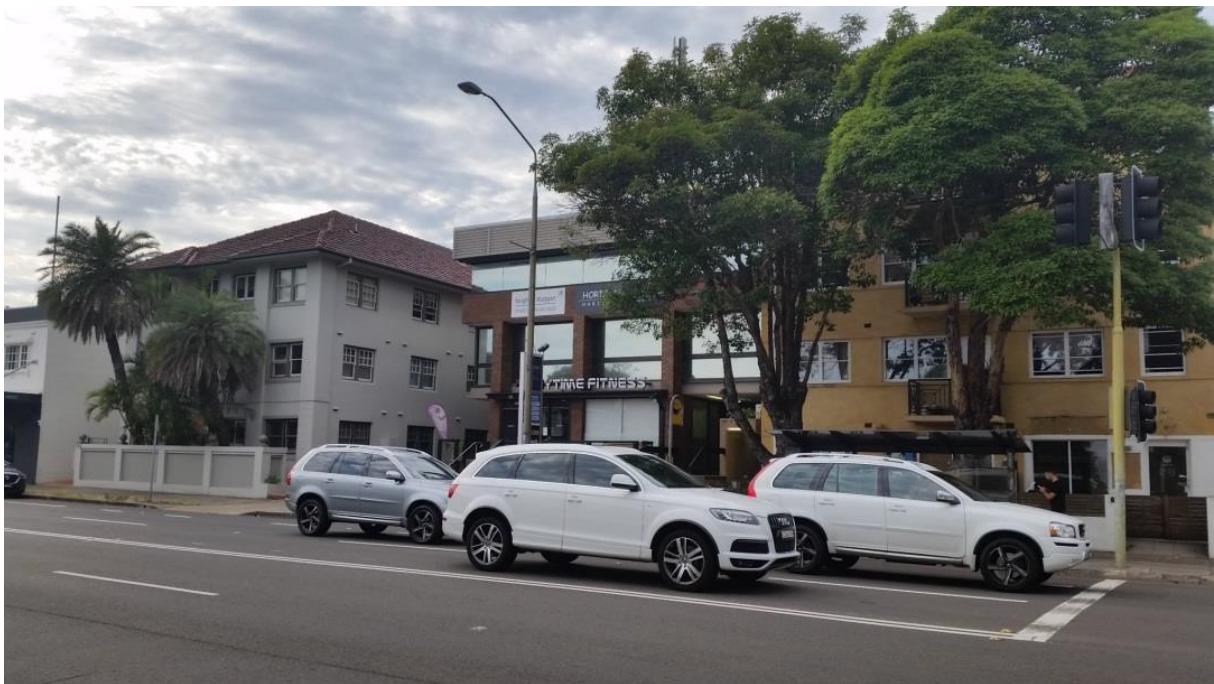
Figure 5: Existing development to the south of the site on New South Head Road, showing examples of typical nearby 2-3 storey mixed use and residential flat buildings

The built form of development surrounding the site includes predominantly mixed use retail / business and residential development, commercial buildings and residential flat buildings. These are generally low scale being 2-3 storeys, although notable exceptions include the 7-8 storey mixed use development and residential flat building neighbouring the site to the west, at 624-634 and 624A New South Head Road. Site photos of the existing development surrounding the site are included as Figures 5 and 6.