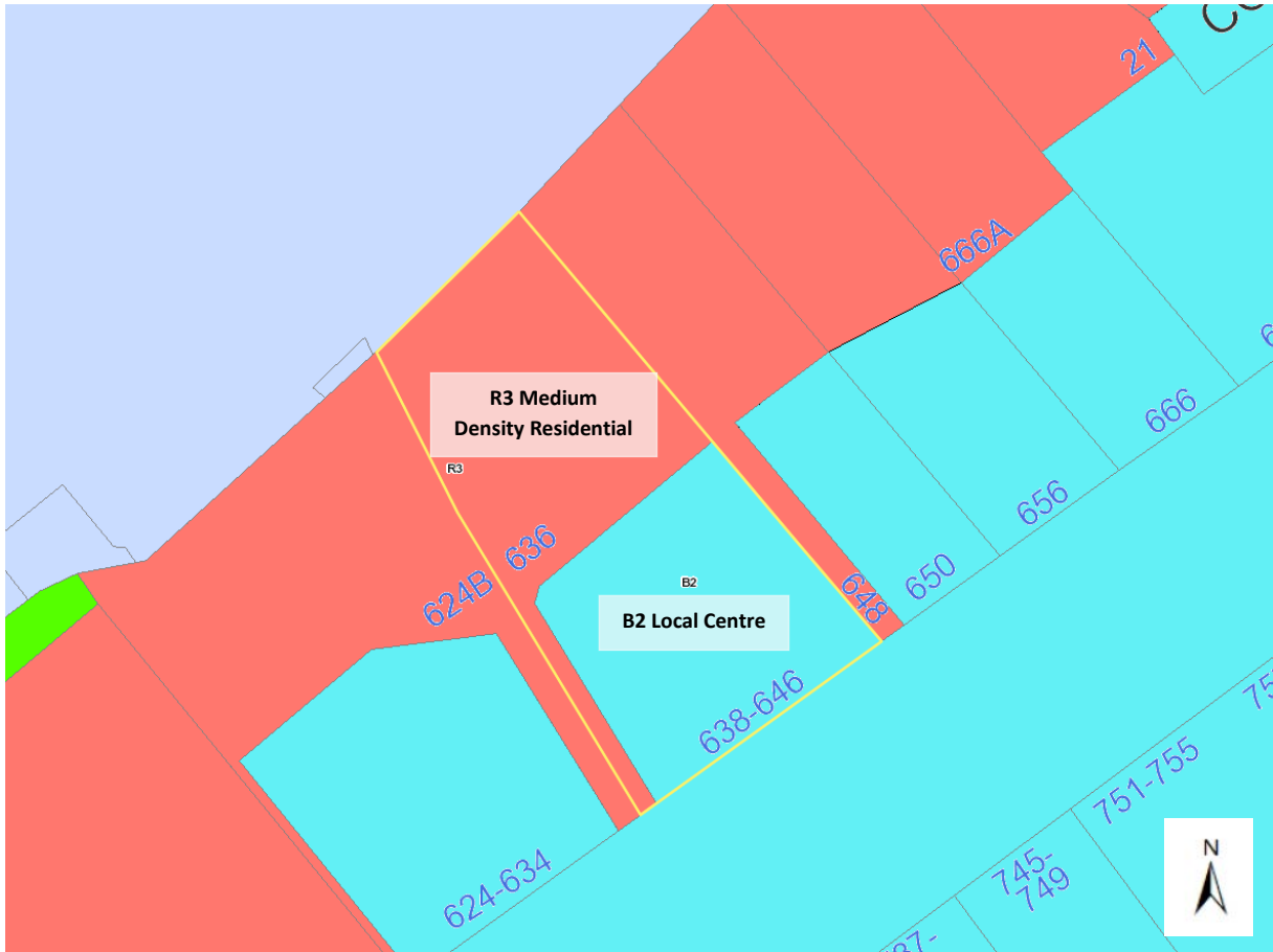
Figure 5: Existing WLEP 2014 land use zoning (site shown by yellow outline)