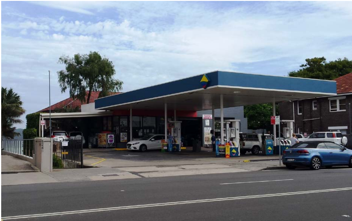
Figure 3: Existing petrol station at 638-646 New South Head Road