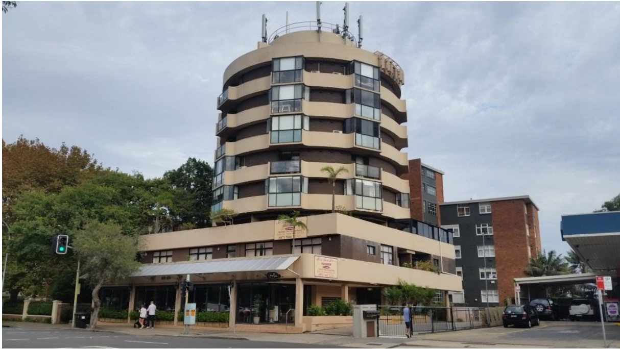
Figure 6 – Existing development to the southwest of the site at 624-634 and 624A New South Head Road, showing notable exceptions to typical development in nearby development

The site is well serviced by public transport with five bus routes running along New South Head Road to the CBD, being route Nos. 323, 324, 325, and L24. Connections are available from these routes at the Edgecliff Bus and Rail Interchange to district centres such as Bondi Junction. The Rose Bay Ferry Wharf is 550m from the centre with services to Circular Quay, Double Bay and Watsons Bay. Woollahra Council has recently improved cycling facilities to make cycling to and from the centre safer and more convenient.