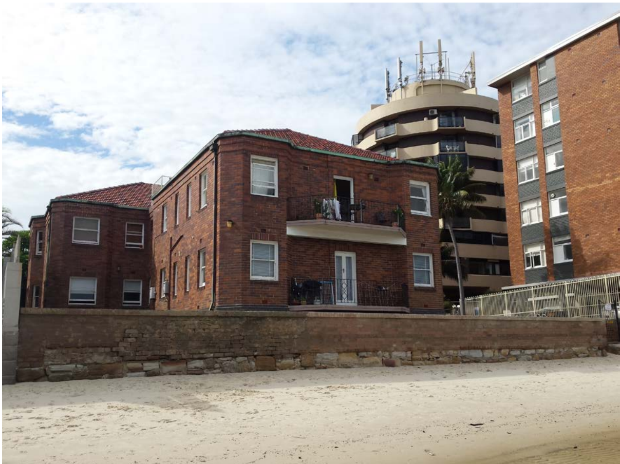
Figure 4: Existing residential flat building at 636 New South Head Road viewed from beach area at Rose Bay