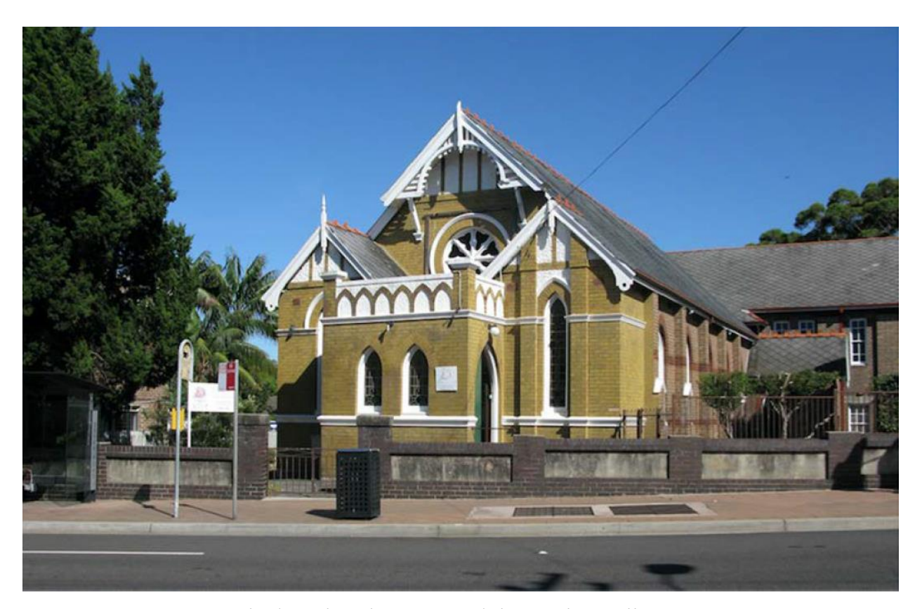
Figure 1: Rose Bay Methodist Church (1904) and the Wesley Hall (1929), (Source: RA Moore February 2018)

The planning proposal applies to the site located on the corner of Dover Road and Old South Head Road, Rose Bay. The street address of the site is 518A Old South Head Road, and the land title is described as Lot 37: Sec: A in DP 4567 (see Figure 1, 2 and 3 below).