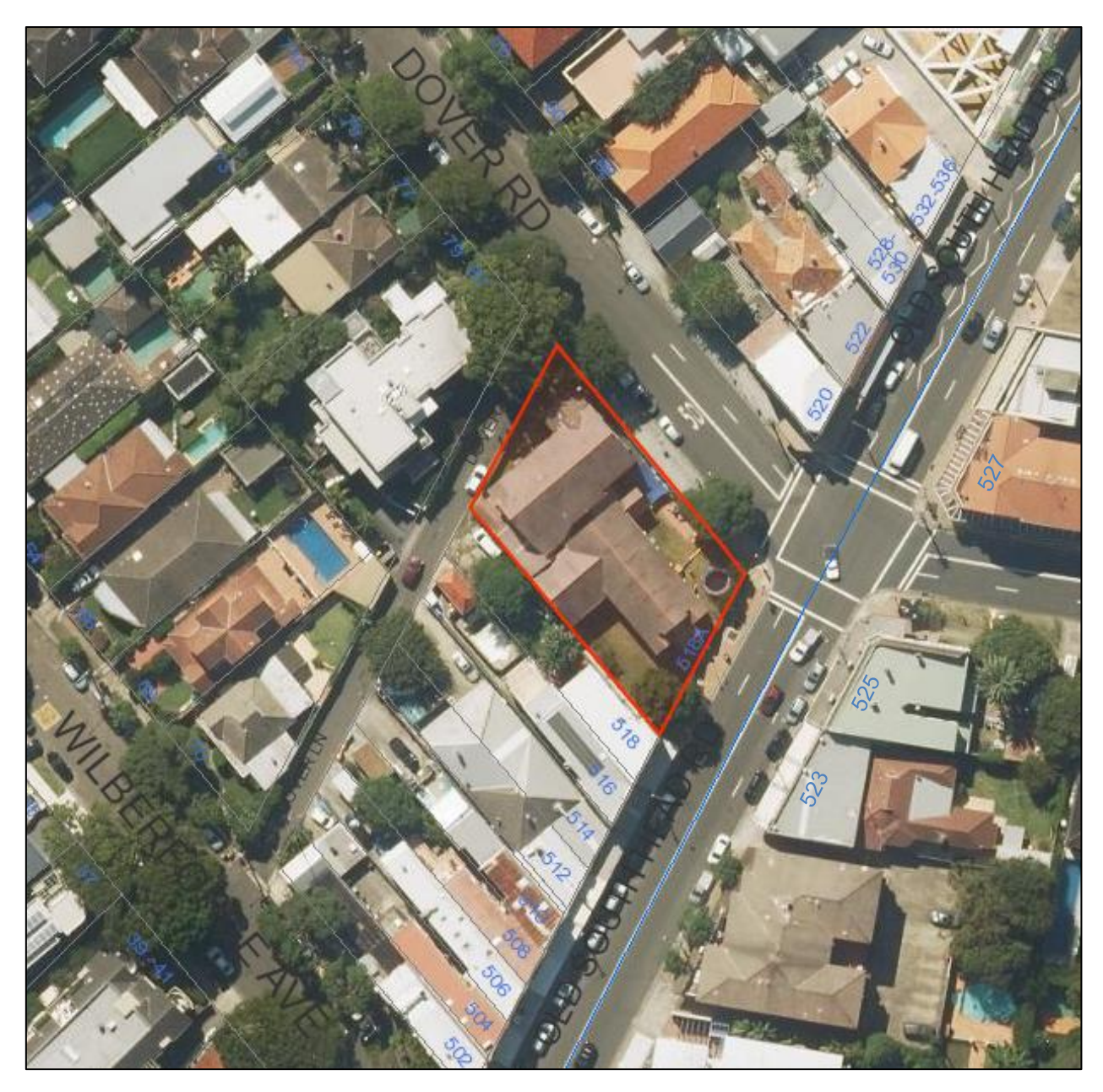
Figure 3: Aerial photograph showing the subject site outlined in red