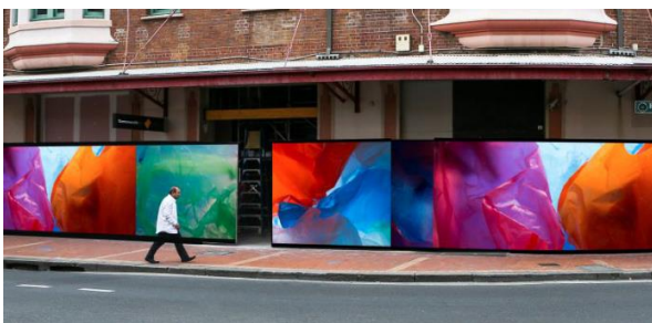
Type A hoarding with artwork