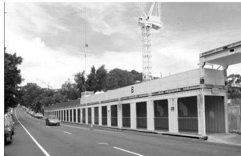
Type B hoarding