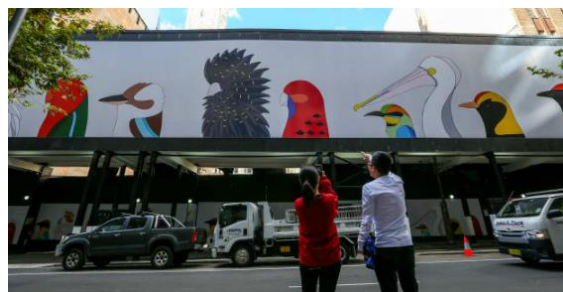
Type B hoarding with artwork