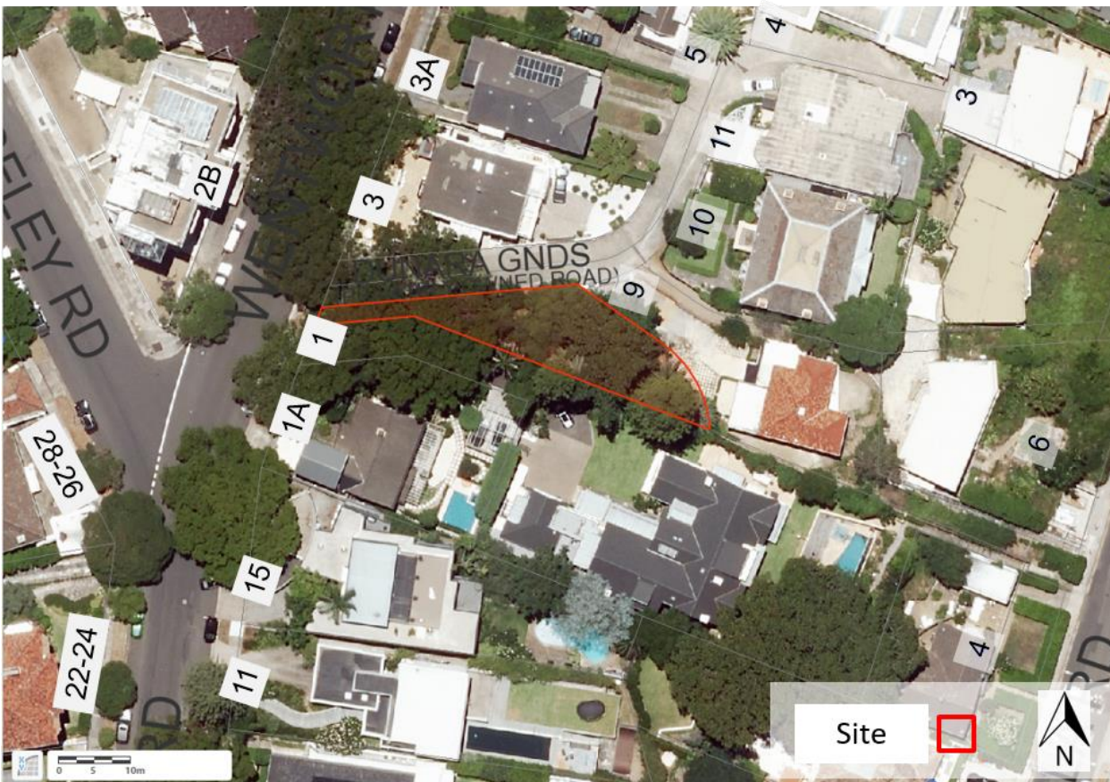
Figure 2: Aerial photograph showing Dunara Reserve outlined in red