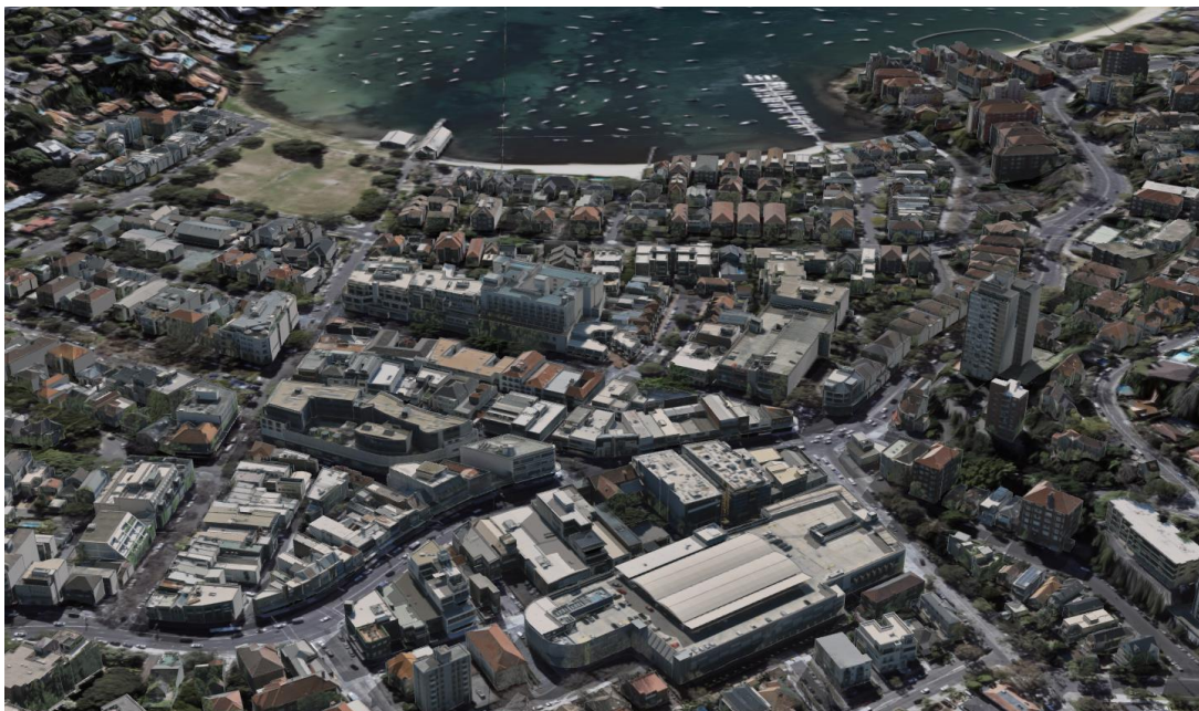
Figure 1: Screenshot of the Woollahra Council Digital 3D Digital Model

If the development is granted an Occupation Certificate, the 'as built' 3D Digital Model will be permanently uploaded into the Woollahra Council 3D Digital Modelling Portal. See Figure 1 below.