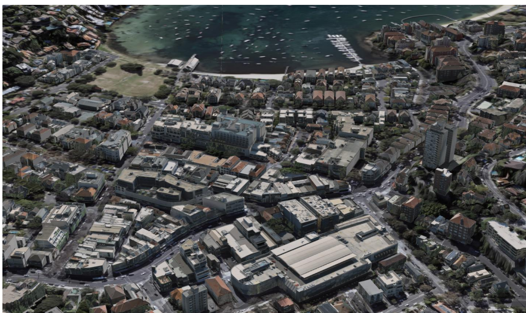
Figure 1: Screenshot of the Woollahra Council Digital Model

If the development is granted an Occupation Certificate, the 'as built' model will be permanently uploaded into the Woollahra Council Digital Model. See Figure 1 below.