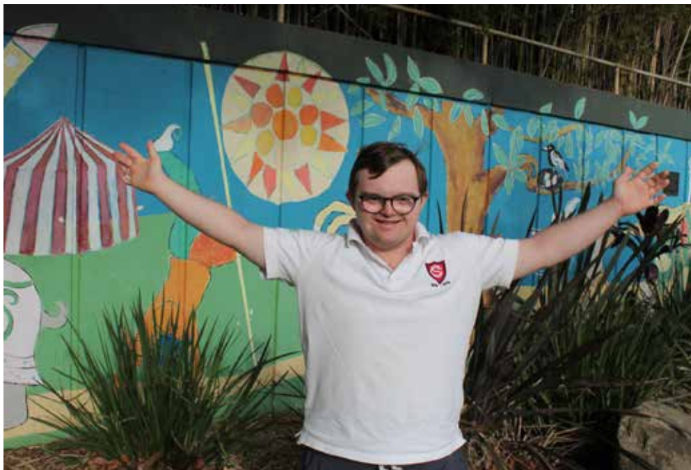
Person smiling and with hands outstretched.