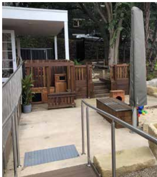
Woollahra Preschool ramp.

Since 2017, Council has done a number of things to make Woollahra better for people with disabilities.