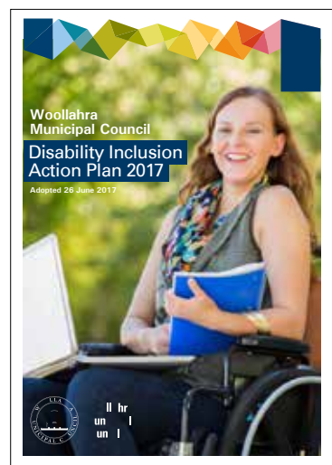
Covers of previous action plans

This is the second Disability Inclusion Action Plan that we have written so far.