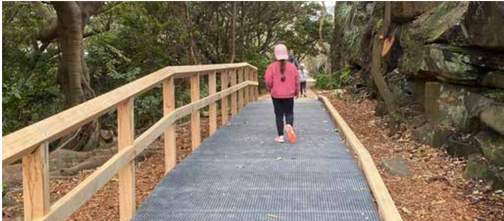
Gap Park Tramway accessible walking path.