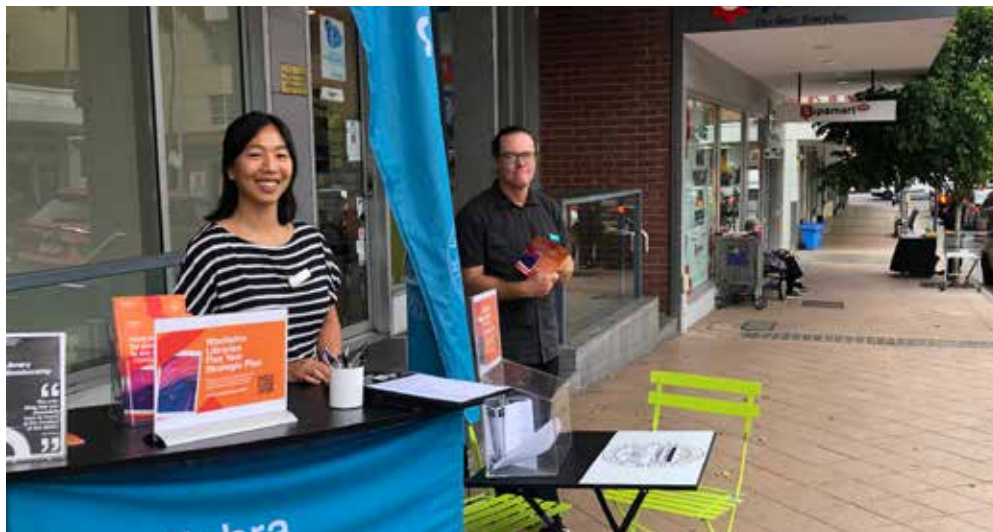
Staff at a community pop-up stand.

This new plan builds on a previous plan that was written in 2017.