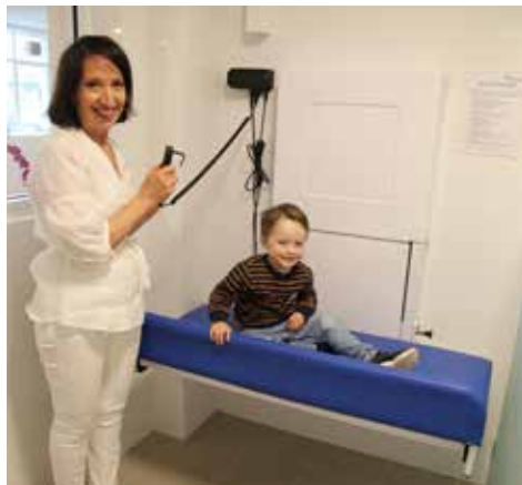
Preschool Director and a child on automatic and adjustable change mat.