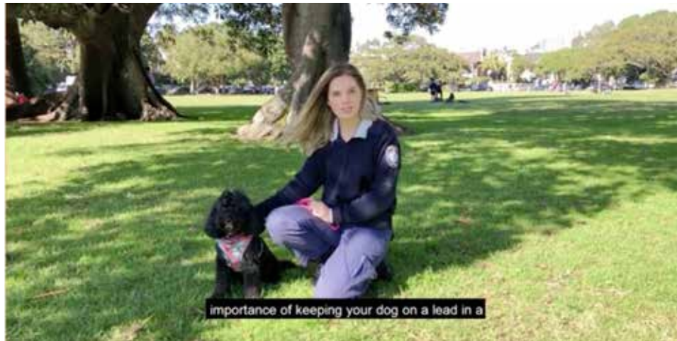
Captioned video with our Companion Animal Officer and a dog in a park