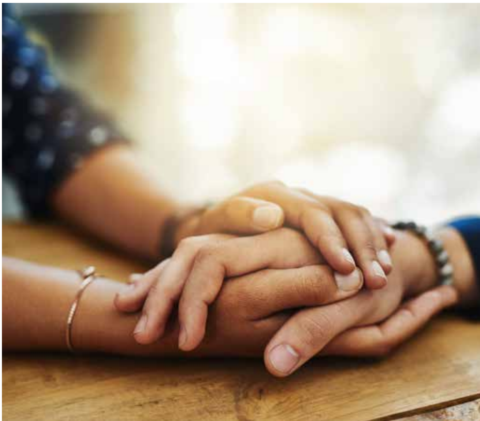
Two people holding hands.

We want to make sure this plan is working well.