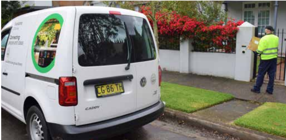
Home Library Service bus and staff member.