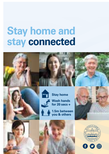
Support services brochures delivered to all households.