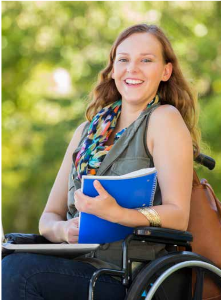
Person in a wheelchair holding a book.