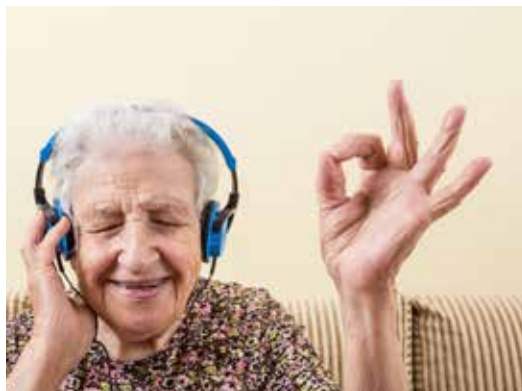
Person with headphones.