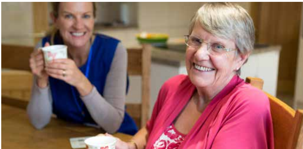
Person with carer enjoying each other's company.