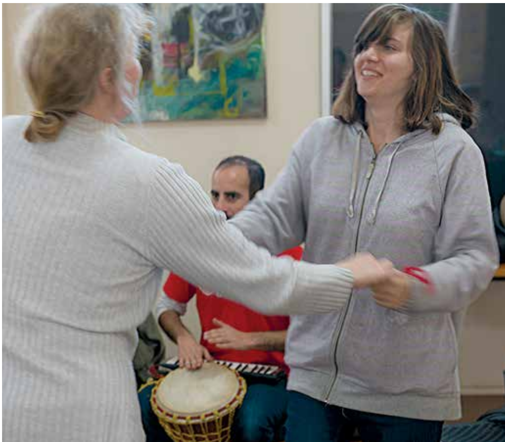
Two people dancing, holding hands and enjoying a live music performance.

We believe everyone in our community should have the same rights and opportunities. We believe everyone's differences should be respected and celebrated.