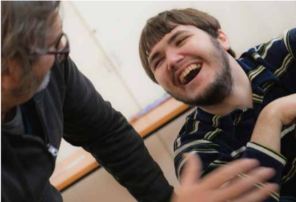
Two people enjoying a happy moment.