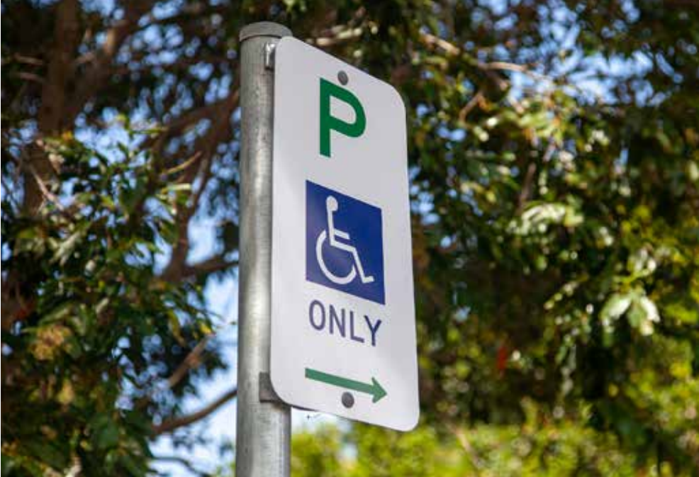
Disabled car parking sign.