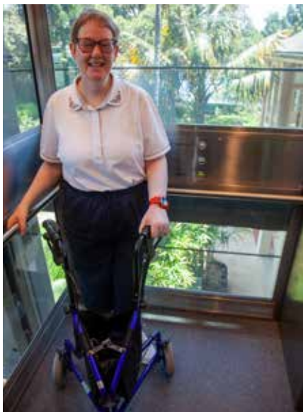
Person in the lift of the new Woollahra Gallery at Redleaf.