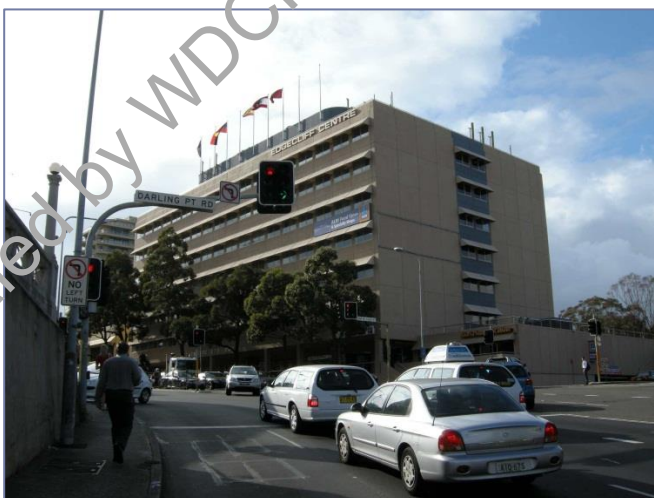
The Edgecliff Centre building