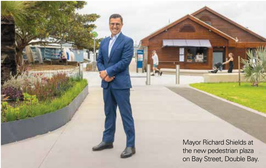
Mayor Richard Shields at the new pedestrian plaza on Bay Street, Double Bay.