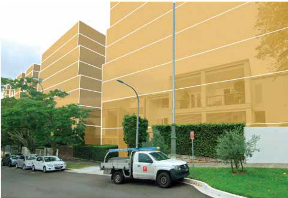
Artist impression: Court Road, Double Bay with current dwellings and an overlay of the proposed changes.