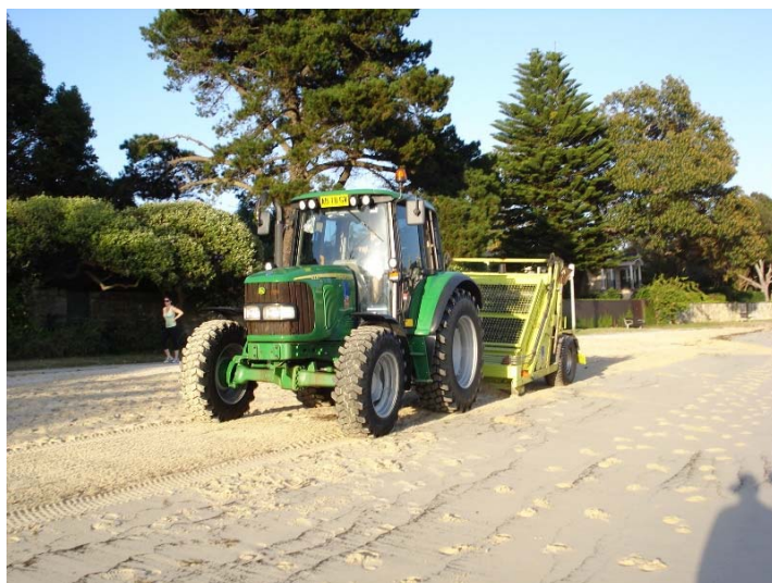
Tractor and mechanical rake at Rose Bay (adjacent to Caledonian Street entrance)

The one-day trial was considered by all involved to be a success. Photographs from the trial have been included in Annexure 4. All beaches visited proved accessible and positive comments from local residents and beach users were received regarding the quality and appearance of the beaches. Staff also considered that the groomed finish of the beaches after mechanical cleaning was aesthetically pleasing and provided strong visual evidence of cleaning operations, and hence, increased community awareness that beaches had been cleaned.