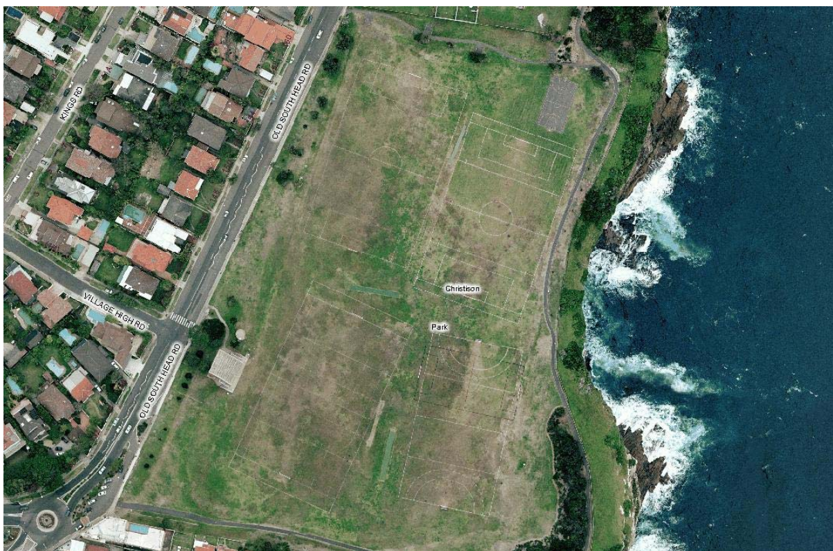
Figure 1. Christison Park

In recognition of the need to meet the water demand required for the turf sports surface, last year we engaged Aqua Consulting Pty Ltd, to investigate the feasibility of providing the water required for optimum turf growth from sources other than mains water, in an ecological manner.