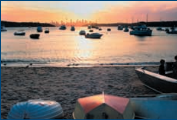
Some images courtesy of Katie Rivers Photography