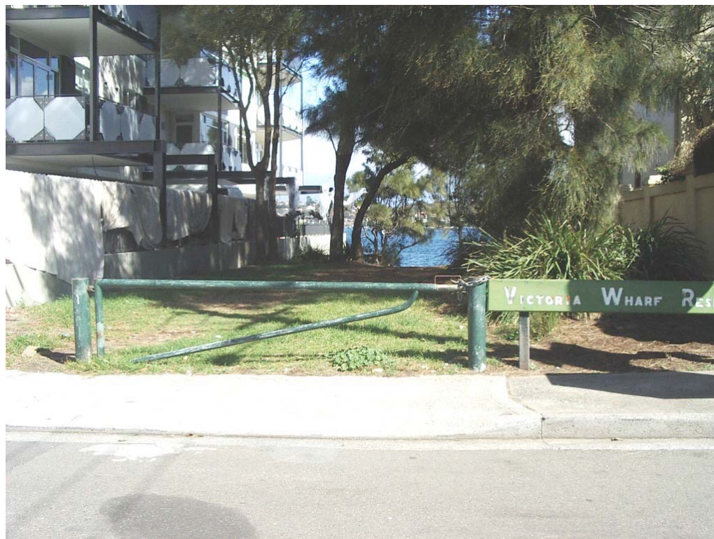
Photograph 1. View of Victoria Street Reserve from Pacific Street.