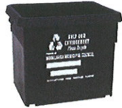
Mixed Container Recycling Crate