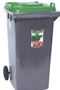
240L Food & Garden Organics Bin