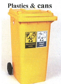
Plastics & cans