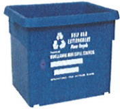
Paper/cardboard Recycling Crate