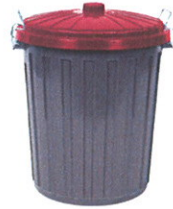
55L Garbage Bin (Paddington & West Woollahra only)