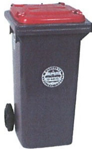
120L Garbage Bin